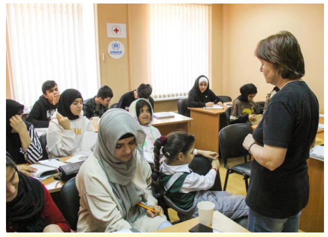
Russian language lesson for refugees from Syria, Yemen and Afghanistan, organized as part of a joint RRC-UNHCR project