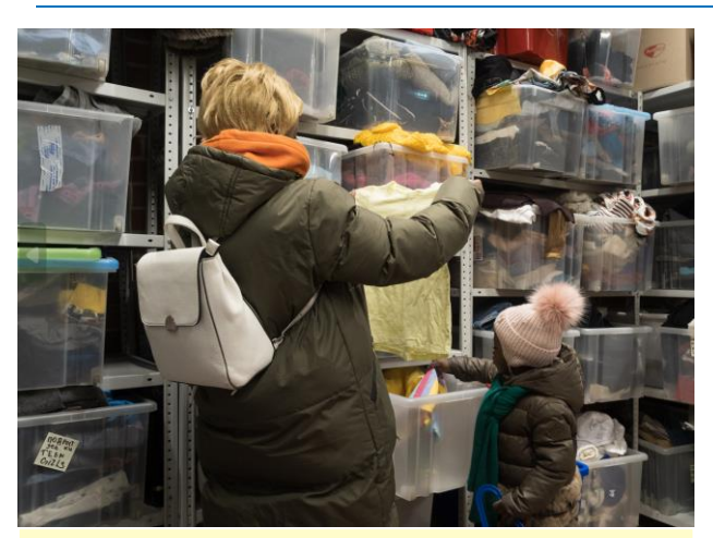
Refugees collecting humanitarian aid from the warehouse of Civic Assistance Committee NGO