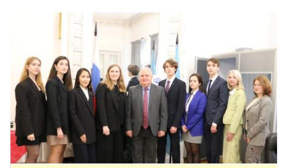
MUNRFE delegation attends UNHCR Russia briefing at the UN House in Moscow.