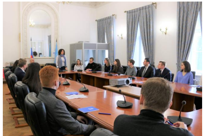
Roundtable with students of the Diplomatic Academy at the UN House, Moscow