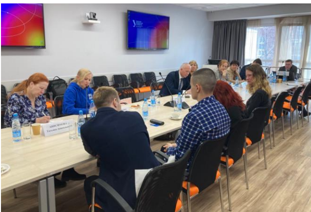
UNHCR Russia staff meeting with Ukrainian students, Ekaterinburg.