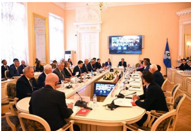
CO Moscow made a presentation during the Session of CIS IPA's Permanent Commission on Political Issues and International Cooperation (online). 19 May 2022