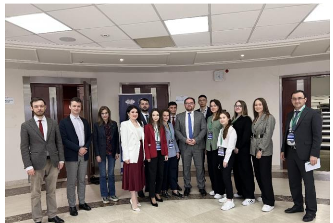
CO Moscow participated in a roundtable on career prospects for students of two major Russian universities. 20 May 2022