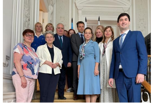
Ilya Chechelnitzky, the first deputy of the working apparatus of the Commissioner for Human Rights in the Russian Federation, with participants of the monthly Coordination Meeting between UNHCR and its Russian NGO partners. 15 June 2022