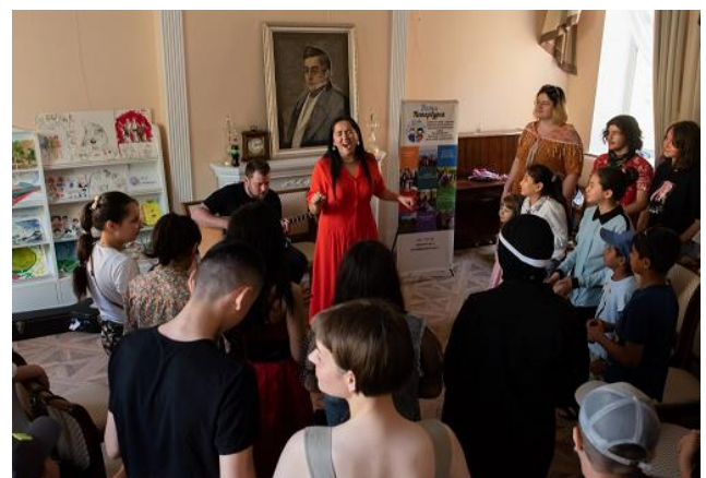
Russian Goodwill Ambassador Manizha performing for the refugee children at the summer camp in St. Petersburg. 28 June 2022