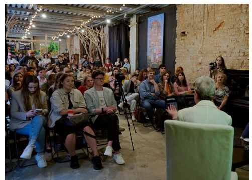
Chairman of the Civic Assistance Committee Svetlana Gannushkina during the Q&A session at the inclusive centre Tverskaya 15 in Moscow. 18 June 2022