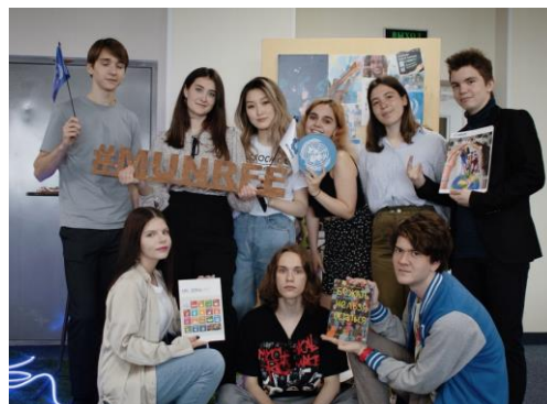
Students of the Far Eastern Federal University joined the global week of solidarity with refugees. 24 June 2022