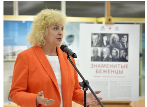
Commissioner for Human Rights in St. Petersburg Svetlana Agapitova speaking at the opening of the “Famous Refugees” exhibition. 20 June 2022