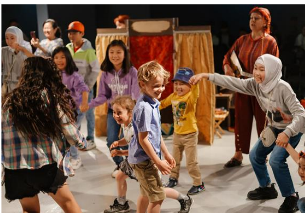
Children attending the theater performance 'Beauty Aygul' based on Afghan fairy tale in Museum of Moscow. 18 June 2022