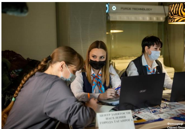
The staff members of an employment centre provide consultations to refugees at a temporary accommodation centre in Taganrog, 23 March 2022