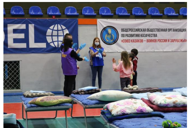
Volunteers play with refugee children in a transit centre in Rostov region, 23 March 2022