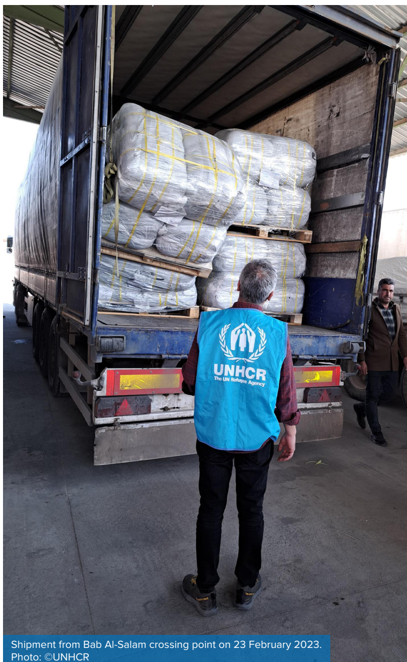
Shipment from Bab Al-Salam crossing point on 23 February 2023.