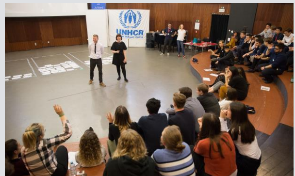
UNHCR during the Hello Czech Republic campaign, raising awareness about refugees among students.

The Czech Government has made contributions to UNHCR for refugee programmes in Serbia, Lebanon and Jordan, as well as for assistance to people displaced due to the current conflicts in Ethiopia and Sudan.