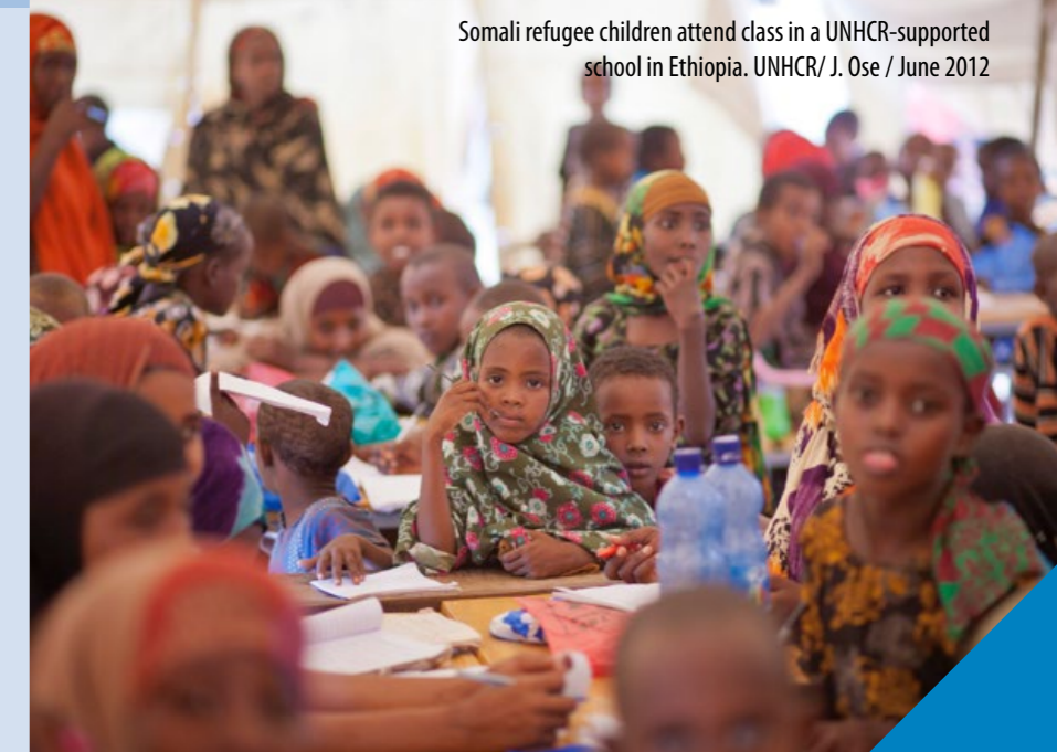
Somali refugee children attend class in a UNHCR-supported school in Ethiopia.

Coordination with MOH and UNHCR's health partners ensured consistent and transparent messaging to the Syrians refugees. Several barriers still exist to the utilisation of services by the poorest refugees. UNHCR supports these refugees in accessing the regular national health services and monitors access and utilisation of the services through the Household Access and Utilization Survey (HAUS) , which ensures support for refugees who cannot afford the fees.