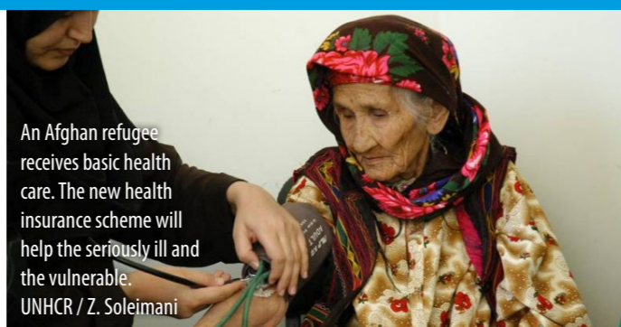
An Afghan refugee receives basic health care. The new health insurance scheme will help the seriously ill and the vulnerable.

Please contact HQPHN@unhcr.org (health) and HQEDUC@unhcr.org (education) for more information on adapting service delivery.