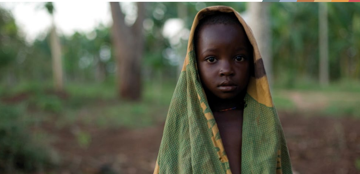
Tanzania / Young Somali Bantu girl in Chogo village. / 2009

Through its Key Initiatives series, DPSM shares regular updates on interesting projects that produce key tools, practical guidance and new approaches aimed to move UNHCR operations forward.