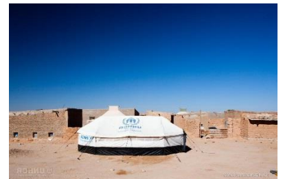
Tents provided by UNHCR in support of refugees affected by heavy rains and flooding in October 2015, Awserd and Laayoune camps.