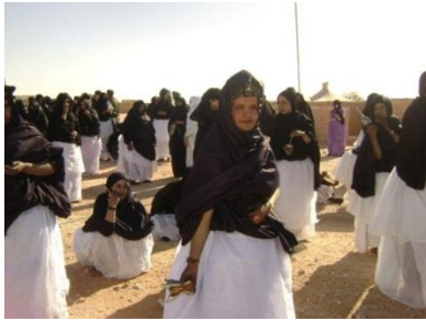
Sahrawi refugee women in traditional dress.