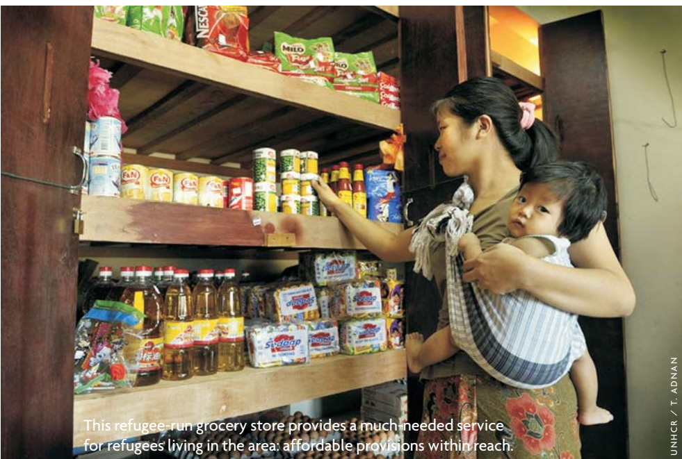
This refugee-run grocery store provides a much-needed service for refugees living in the area: affordable provisions within reach.