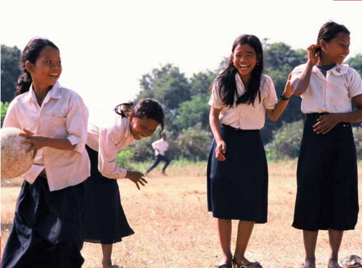
© Thomas Moran 2003 - MKH0009

IOM is committed to the protection of migrant girls, including unaccompanied girls. For example, in Zimbabwe, it provides shelter to unaccompanied minors deported from South Africa and Botswana while tracing of their family is ongoing. Skills training is also provided. IOM has also recently published “The Rights of Migrant Children”, International Migration Law Series No. 15.