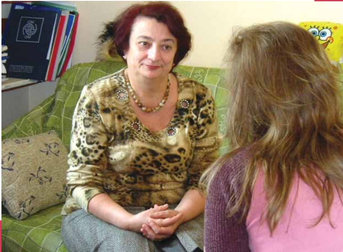
IOM psychologist listening to a victim of trafficking in a rehabilitation centre in Moldova

A current project, for example, aims to assist victims of trafficking and exploited cabaret workers