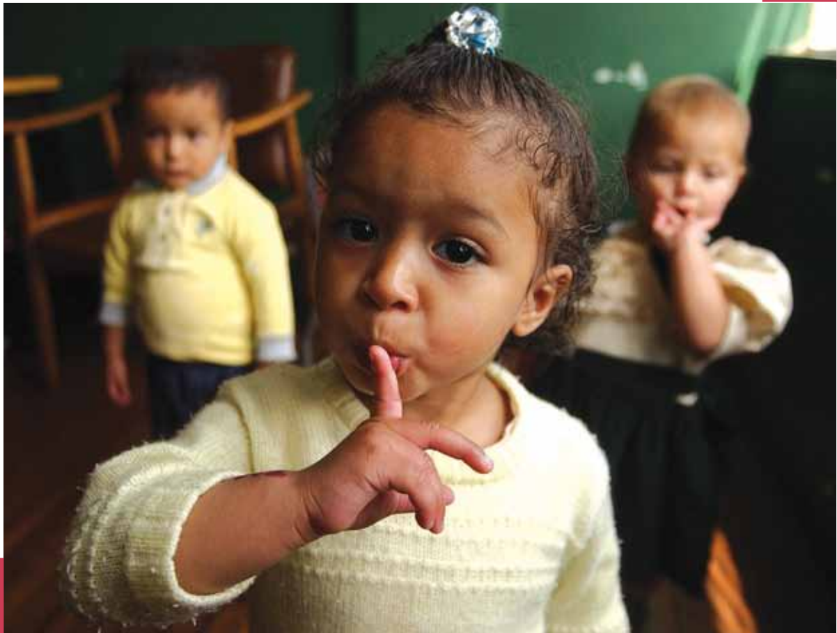
Children in an IOM supported day-care centre

Services also target children of victims of trafficking. For example, in Ecuador, a Child Development Centre provides therapeutic, educational and recreational space for the children of VoTs in order to facilitate the participation of young mothers in their children's education and well-being. Given the high security risks faced by some victims, the existence of an on-site child care centre also constitutes a risk reduction factor.