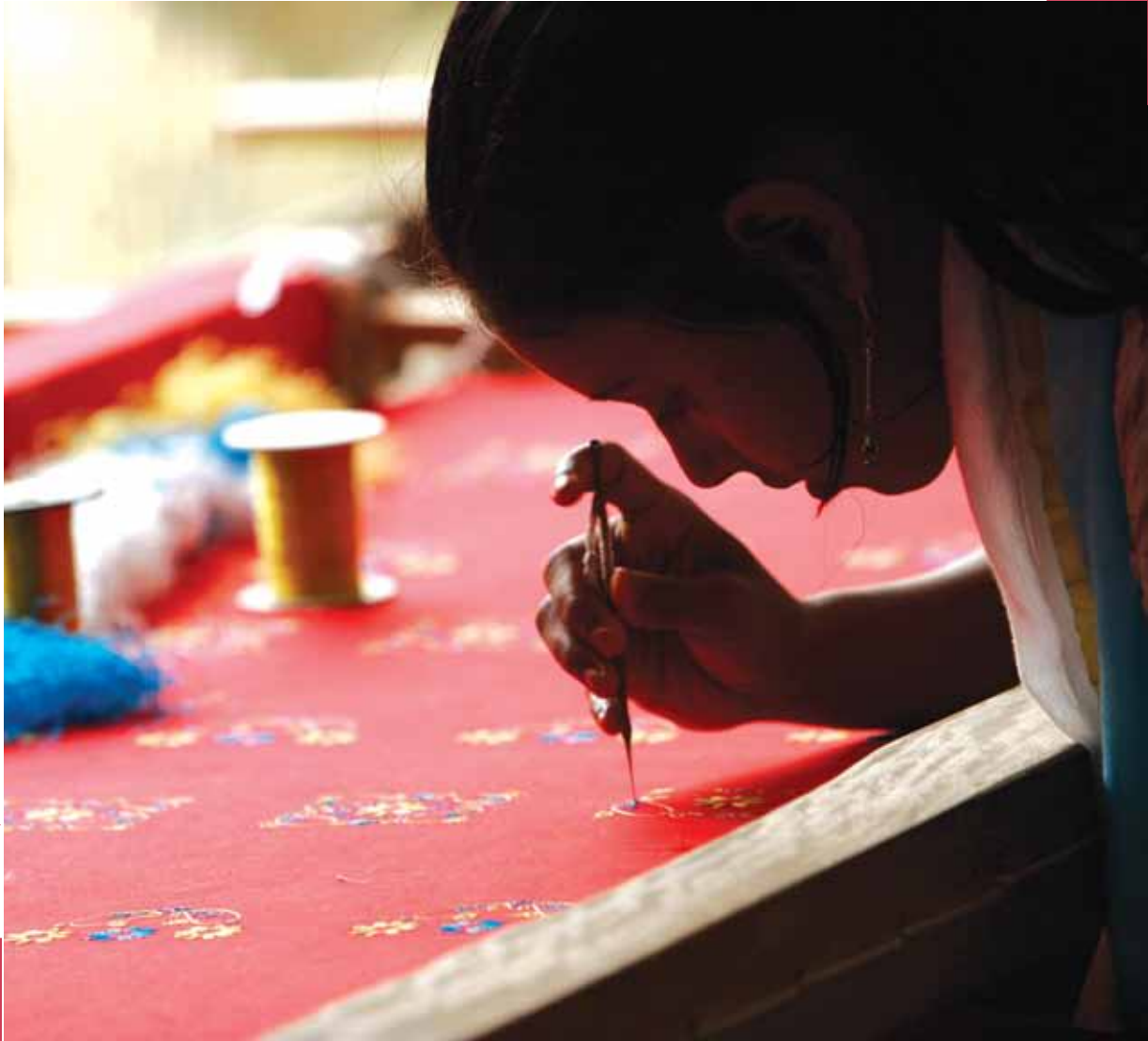
© IOM 2007 - MBD0008 (Photo: Bashir Ahmed Sujan)

In Bangladesh, IOM developed an English language training manual for nurses and hotel workers, as well as a training manual on housekeeping activities for female migrant workers, which covers language skill development, cultural orientation, negotiation skill and protection issues.