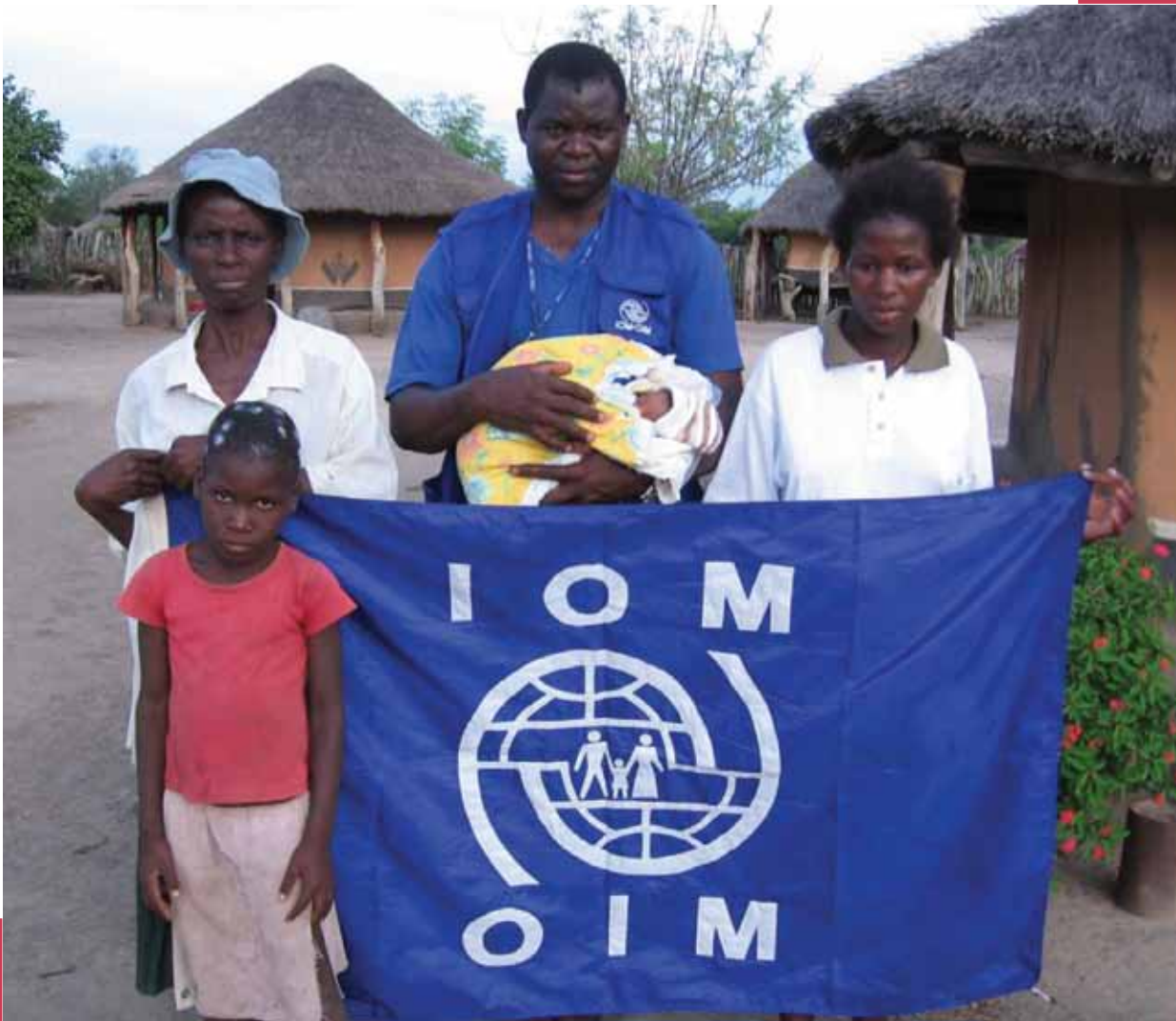
In Zimbabwe, a mother posing with the IOM project nurse who escorted her and her newborn baby

IOM is particularly concerned with providing the highest attainable standard of physical and mental health for migrants in general and for women migrant workers in particular. It is involved in the delivery of direct health assistance to migrant populations, through interventions and prevention strategies to combat ill health among migrants and their host communities and through the integration of migrant health concerns into public health policies globally. For example, in Zimbabwe, IOM provides voluntary, counselling and testing (VCT), HIV post-exposure prophylaxis (PEP), emergency contraceptives and counselling for gender-based violence survivors. Survivors with severe mental breakdown are referred to mental health institutions. The Organization is also engaged in an advocacy campaign to prevent the deportation of women in advanced pregnancy stages or those who have recently delivered.