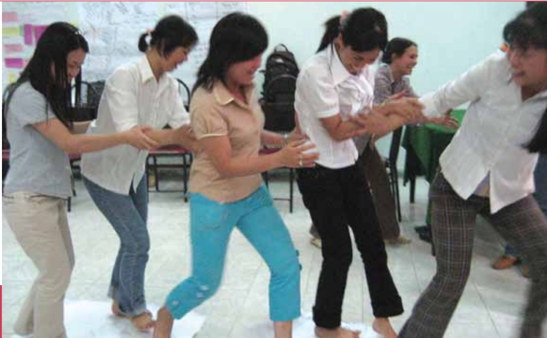
Young women during one of the self-help group sessions in Viet Nam

The women involved were able to articulate their needs and priorities to the government, mass organizations, media, and the wider community, through awareness-raising activities such as an exhibition, quiz events, singing and drama performances and the distribution of information and education materials. The project established an effective model that is replicable in other areas with large numbers of migrants, and women in general.