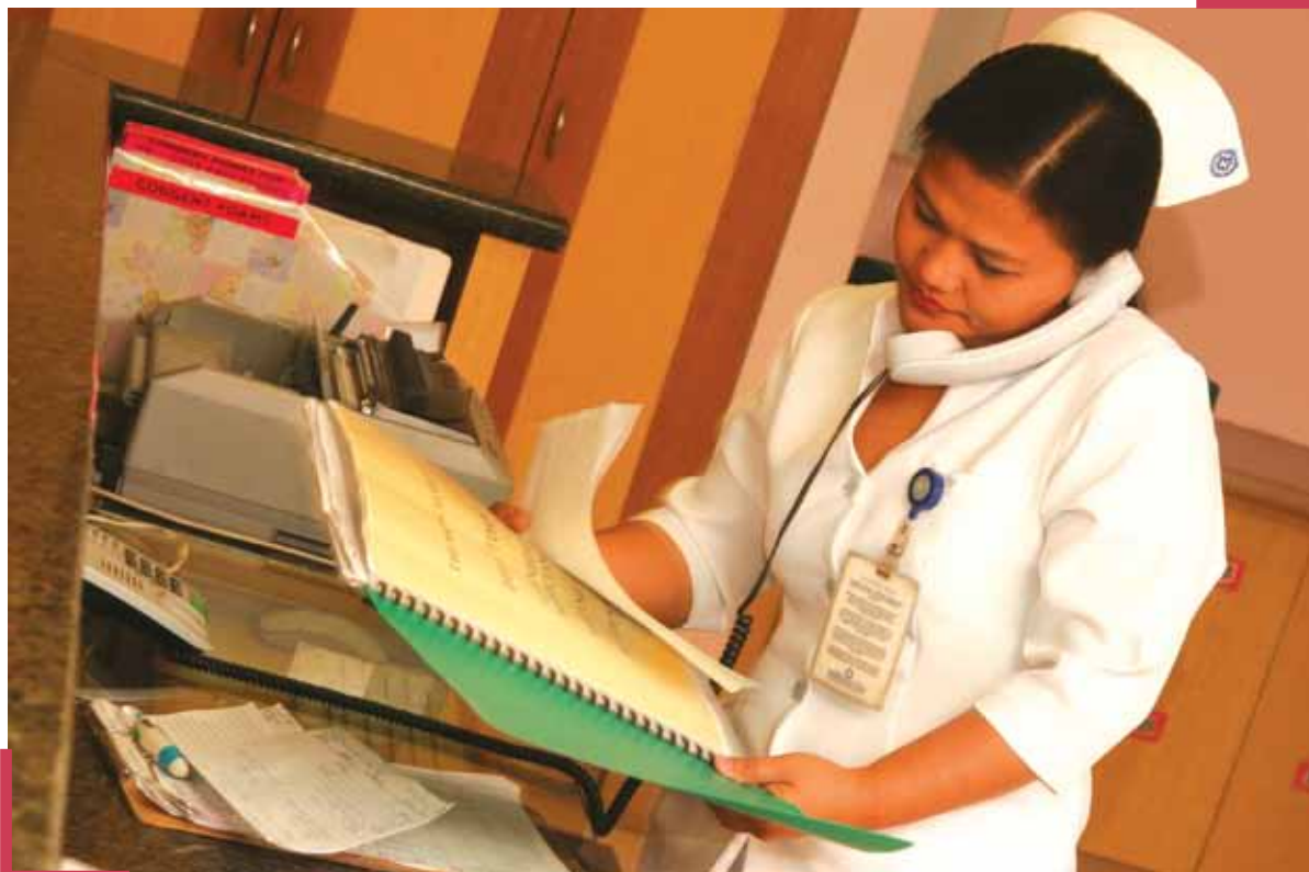
© IOM 2007 - MPH0129 (Photo: Angelo Jacinto)