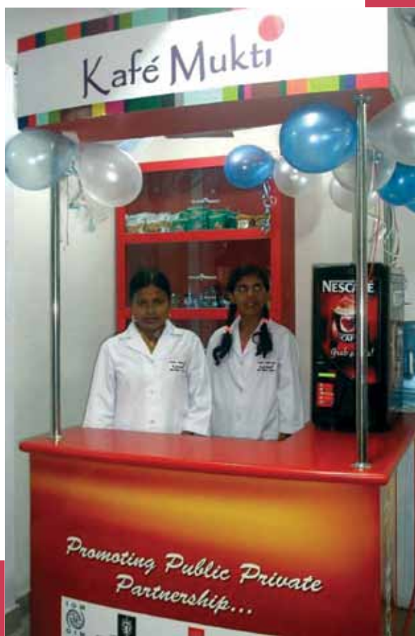
Two returnees working in a Kafé Mukti kiosk in Bangladesh

The Kafés, each of which employs two women, sells tea and coffee from vending machines provided free of charge by Nestlé, as well as snacks and utility items like pens, notebooks and soap.