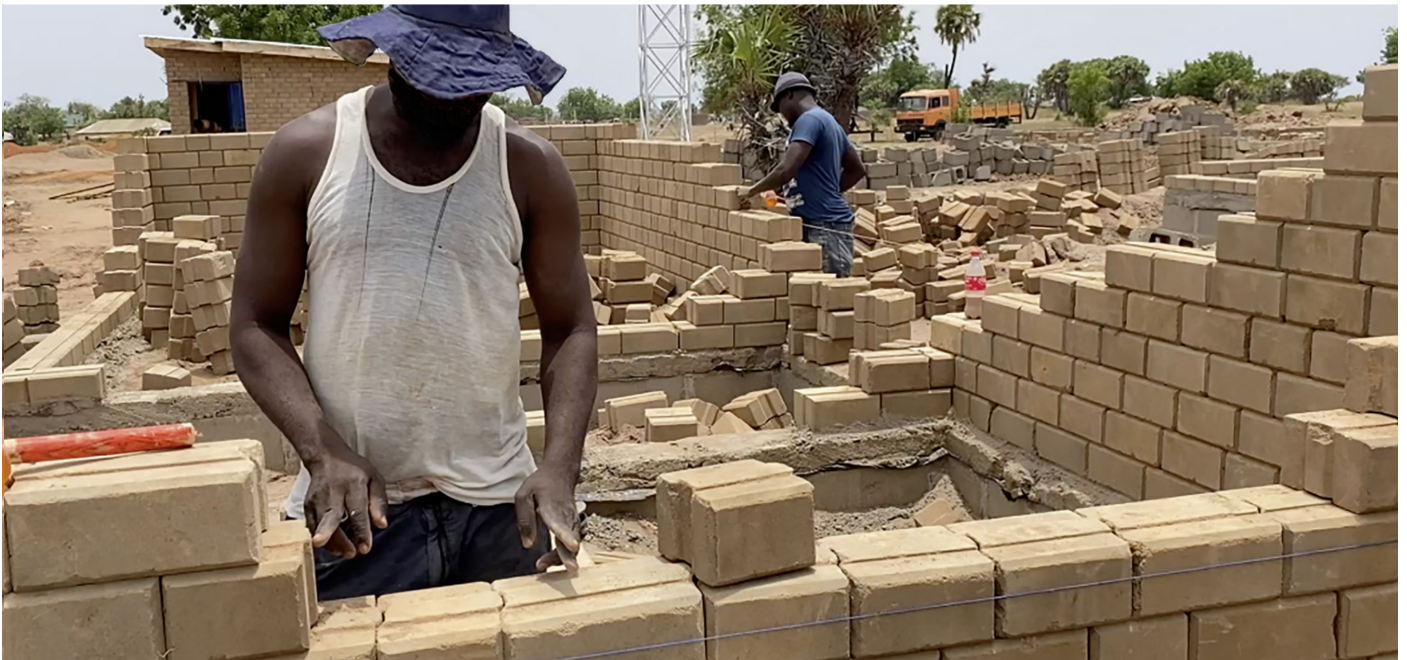
Brick laying, ISSB-Construction, Nigeria