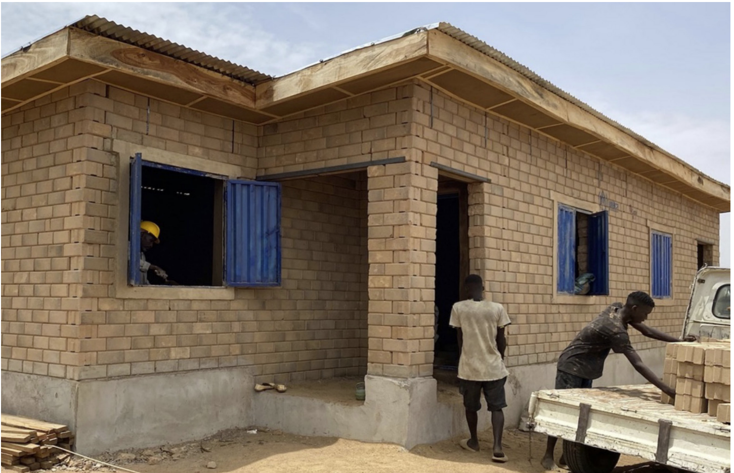
ISSB Double Shelter, Nigeria