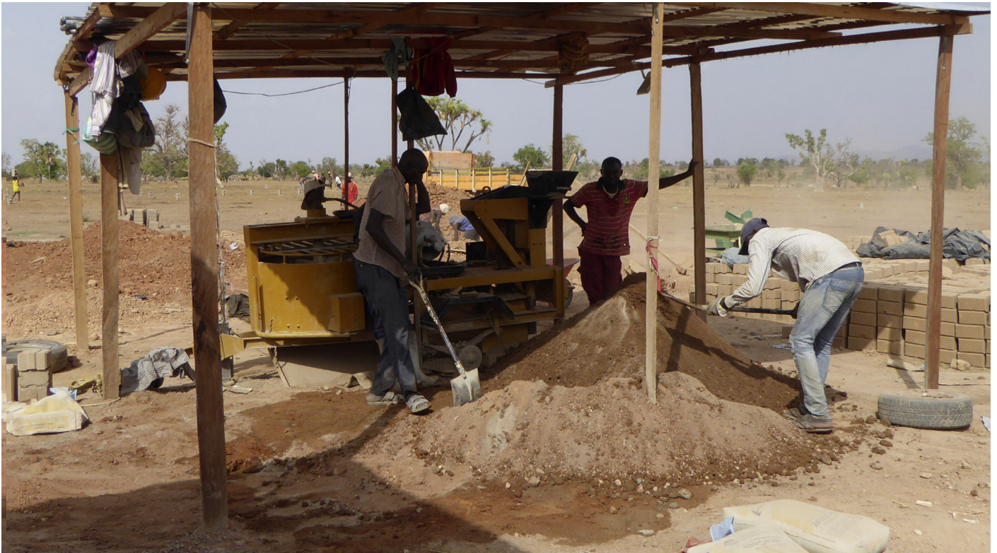
Block production with a portable, hydraulic machinery