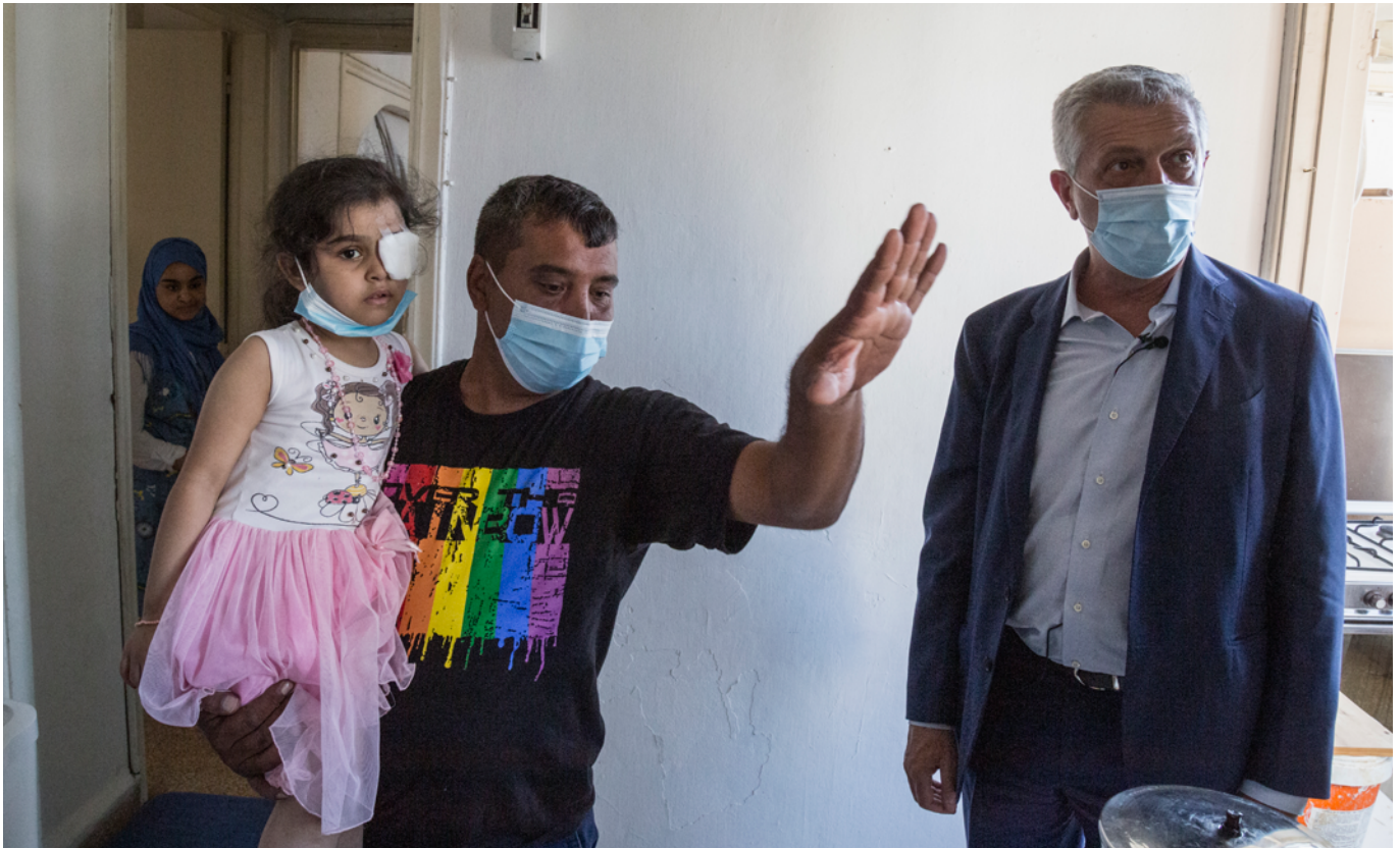
UNHCR High Commissioner Filippo Grandi looks at damage caused to the apartment of Syrian refugee Makhoul at his home, in the aftermath of the Port Explosion, in Beirut, Lebanon, on August 19, 2020. Makhoul's six year-old daughter's eye was badly injured in the blast and the family's apartment had its windows blown out. The family of six fled to Lebanon in 2016 to escape the war in their home country, Syria.