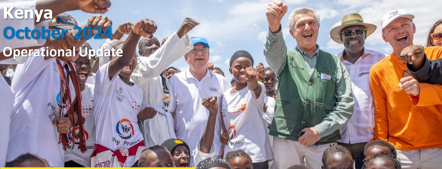
UNHCR High Commissioner Filippo Grandi and International Olympic Committee President Thomas Bach cheer alongside sports participants at the Kalobeyei Sports Complex on 26 October.