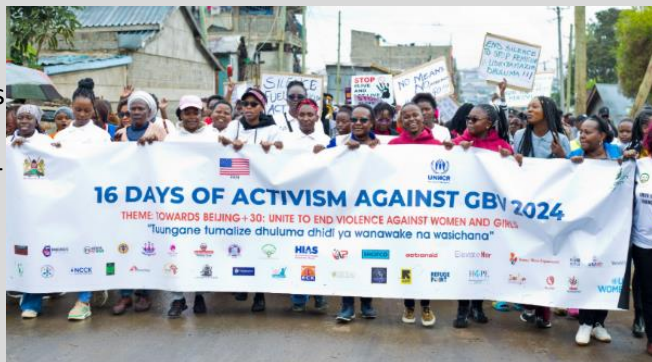
On 27 November, the Nairobi City County Govt Gender Directorate, UNHCR, DRS, and partners launched 16 Days of Gender Activism events, calling for the protection of women and girls.