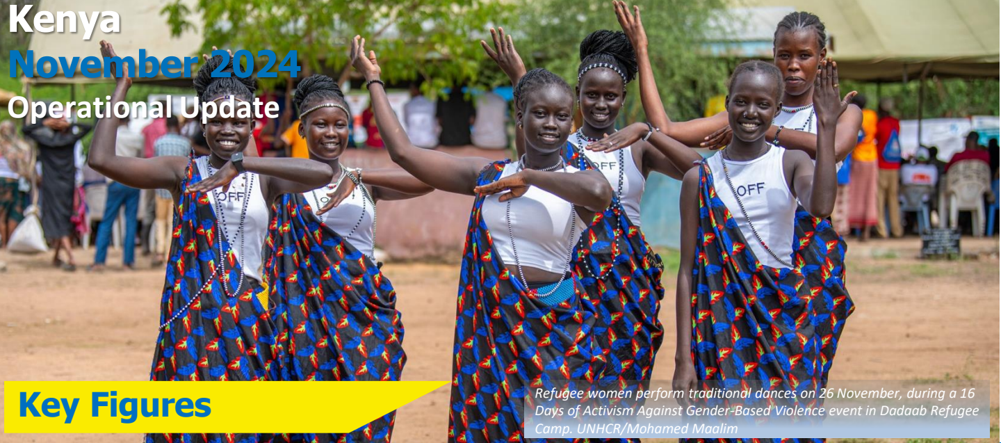
Refugee women perform traditional dances on 26 November, during a 16 Days of Activism Against Gender-Based Violence event in Dadaab Refugee Camp.