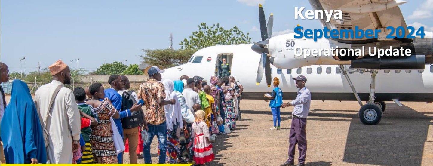
A new chapter begins for Burundian refugees returning home from Kakuma. UNHCR supports voluntary repatriation and in 2024, 946 refugees have been repatriated to Burundi.