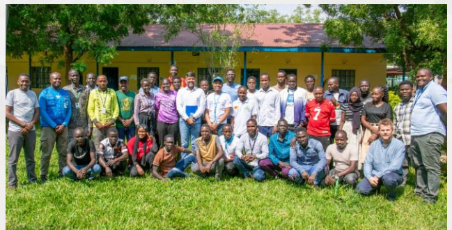
UNHCR and connected education team trains 35 teachers on integrating ICT in teaching and learning in Kakuma Refugee Camp.