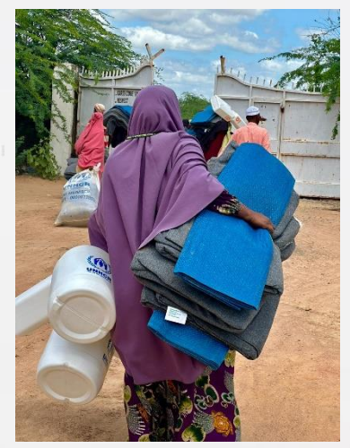
A refugee woman collects core relief items during a distribution by UNHCR, supporting flood-affected families in Dadaab.

UNHCR currently supports 382,658 refugees and asylum seekers across three refugee camps and the Ifo 2 settlement.