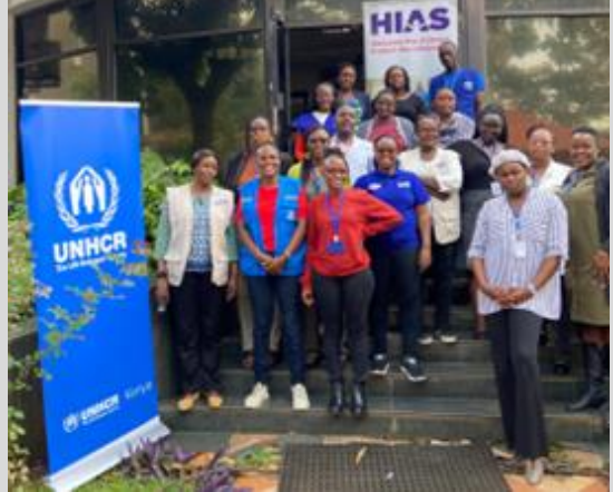
On 30 May, UNHCR and HIAS conducted a refresher training on GBV case management, to improve front-line response. @UNHCR

• In May 2024, a total of 59 refugees departed to Canada, New Zealand and Australia through complementary pathways.