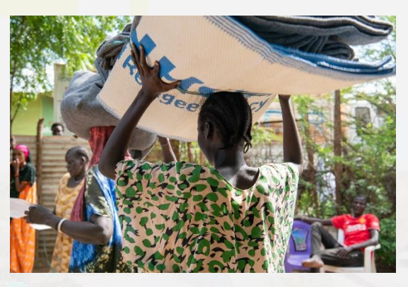
Heavy rains impacted Kakuma and Kalobeyei, with 22 families being relocated after their shelters were damaged. UNHCR coordinated with partners to support those most in need.