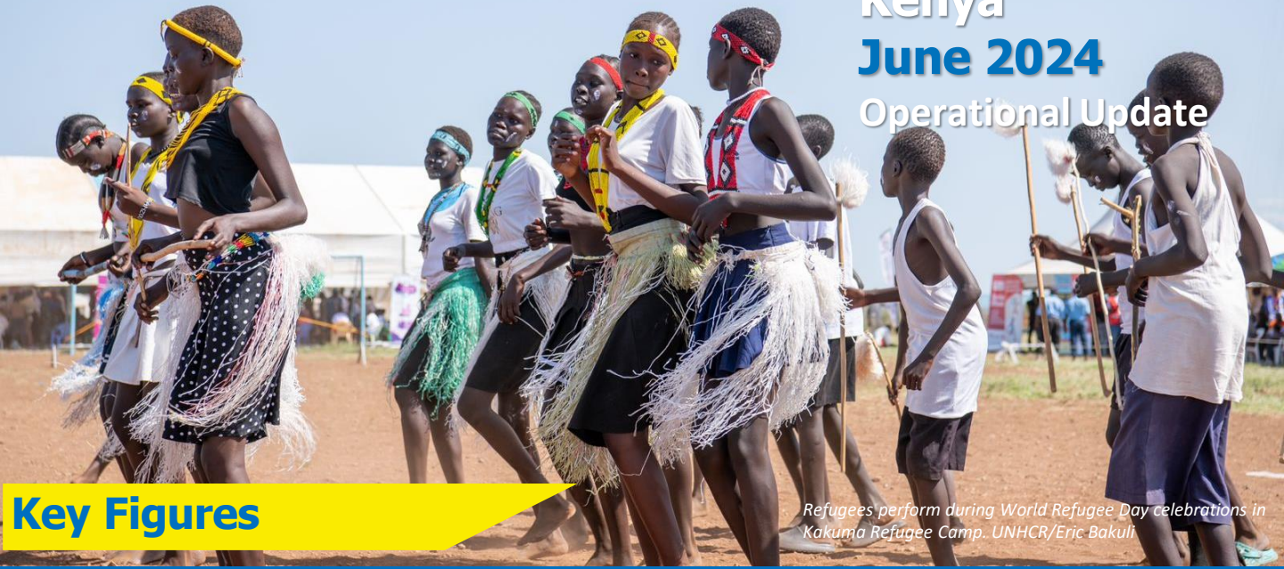
Refugees perform during World Refugee Day celebrations in Kakuma Refugee Camp.