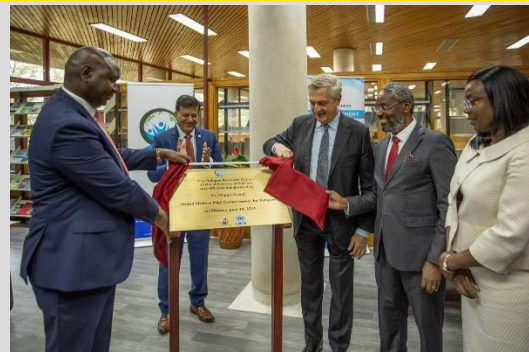
A plaque is unveiled during the inauguration of the Refugee Resource Centre on 24 June.