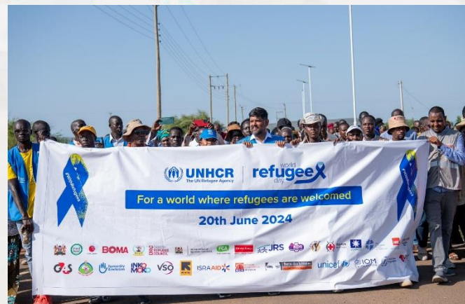
UNHCR joins partners, refugees and members of the local community for a solidarity walk on World Refugee Day in Kakuma Refugee Camp.