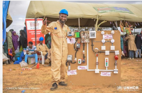
A refugee displays a stall during World Refugee Day in Dadaab on 20 June