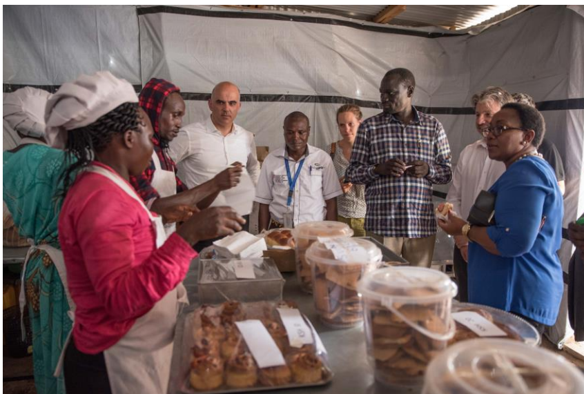
Photo: President of Swiss Confederation, H.E. Alain Berset, enjoys a Swiss roll made by refugees when he visited a refugee owned bakery at Kalobeyei settlement