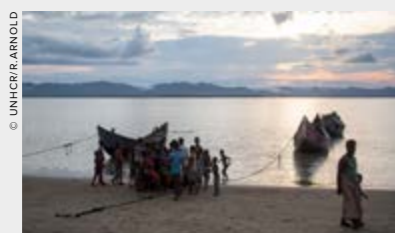
Many refugees fleeing Myanmar experience unimaginable horrors.

Finally, when conditions are conducive and allow, UNHCR is prepared to support the voluntary return of refugees to their places of origin in Myanmar, working alongside the respective governments. This would require an end to violence, and safety and security restored for all, as well as progress on citizenship and rights and inclusive development for all communities in Rakhine State.