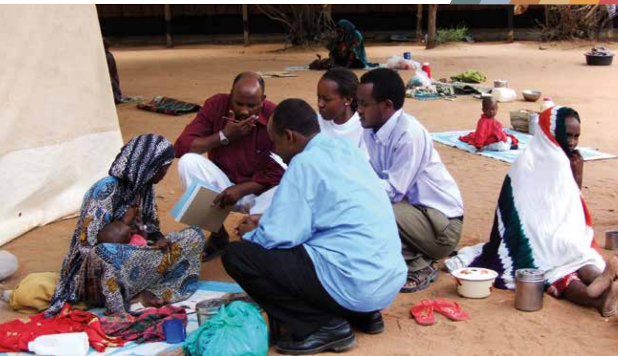
Kenya / Dadaab refugee camp / A SENS team is collecting nutritional data from a refugee family. Consisting of 4 people, as recommended by the SENS Guidelines, each member of the SENS team is responsible for some aspect of the data collection process, such as recording data, taking measurements, and testing for anaemia.

Through its Key Initiatives, UNHCR's Division of Programme Support and Management (DPSM) shares regular updates on interesting projects that produce key tools, practical guidance and new approaches aimed at moving UNHCR operations forward.