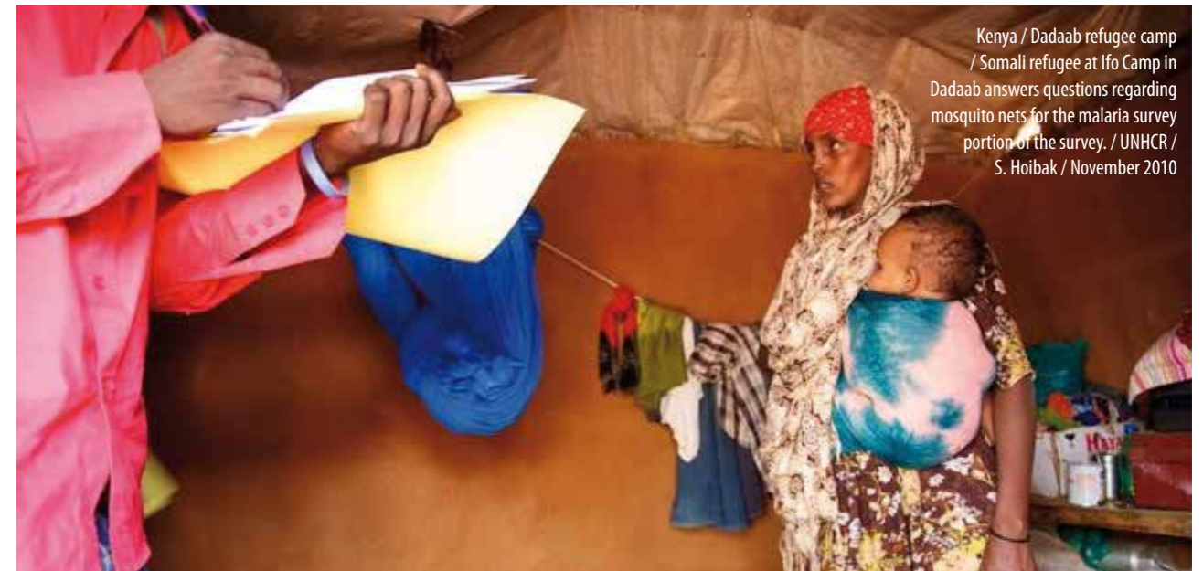
Kenya / Dadaab refugee camp / Somali refugee at Ifo Camp in Dadaab answers questions regarding mosquito nets for the malaria survey portion of the survey. / November 2010

Nutritional data collected using SENS in February 2013 detected high levels of anaemia in all camps in Burkina Faso and the high incidence of acute malnutrition in Goudebou camp. As a result of these findings, UNHCR began blanket feeding with SUPER CEREAL plus, a nutritive, porridge-like corn soya blend, in Goudebou camp with a view to improve the nutrition situation for children aged 6 to 59 months. Another follow up action to the SENS data is the up-coming roll out of blanket feeding with the micronutrient powder Nutromix in all camps.