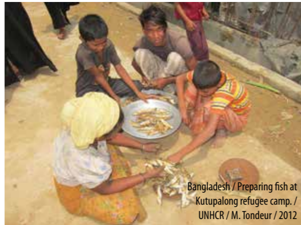
Bangladesh / Preparing fish at Kutupalong refugee camp. / UNHCR / M. Tondeur / 2012

To use mobile technology for data collection in surveys, UNHCR has chosen smartphones with Android platform using the Open Data Kit (ODK) application for data collection. Technical support for the field is available from the Public Health Section at UNHCR Headquarters.