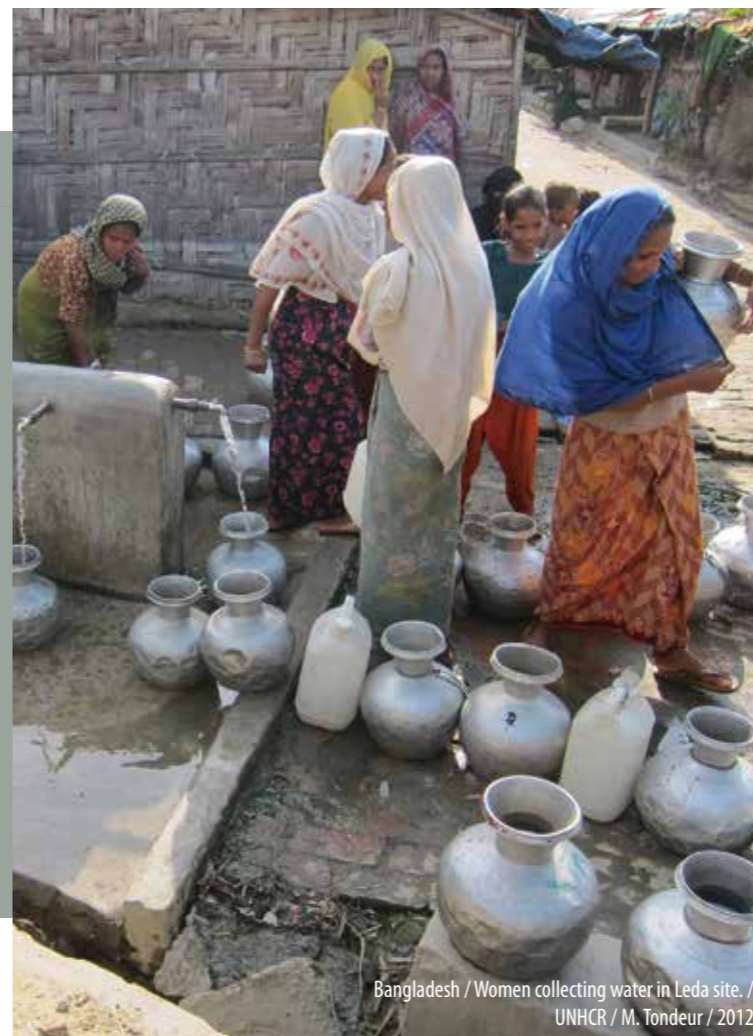
Bangladesh / Women collecting water in Leda site. / 2012