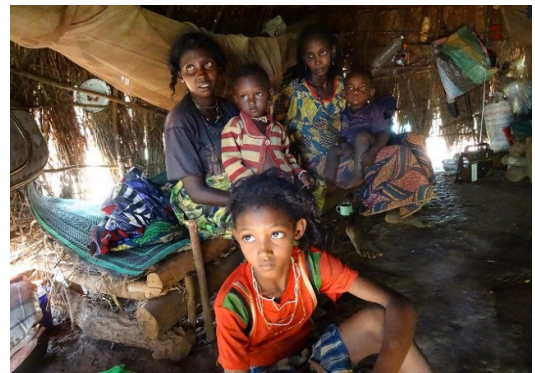
A group of women met by the joint Protection team in Domborou, a village near Yaloke, /August 2015.

■ As of 31 August, 12,658 spontaneous returns from Cameroon and Chad have been identified through 13 border points in Nana Mambere along the CAR border with Cameroon and Chad. The 1,983 spontaneous returnees identified in August 2015 reported that the main reason for return is voter registration. The National Refugee Commission tasked to register spontaneous returns since July 2015 in main return areas has registered 2,940 spontaneous returns in Nana Mambere and Nana Gribizi prefectures.