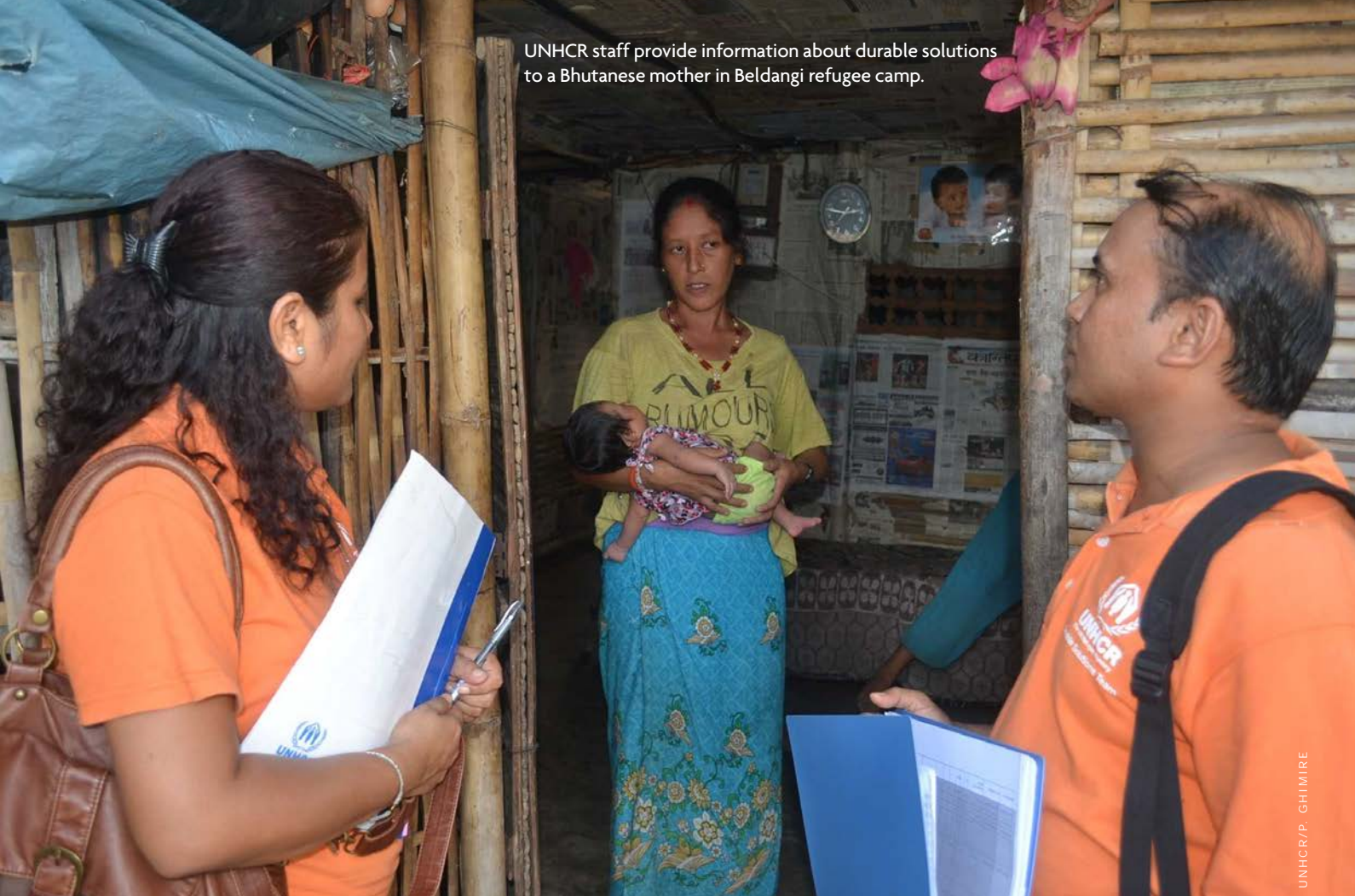
UNHCR staff provide information about durable solutions to a Bhutanese mother in Beldangi refugee camp.