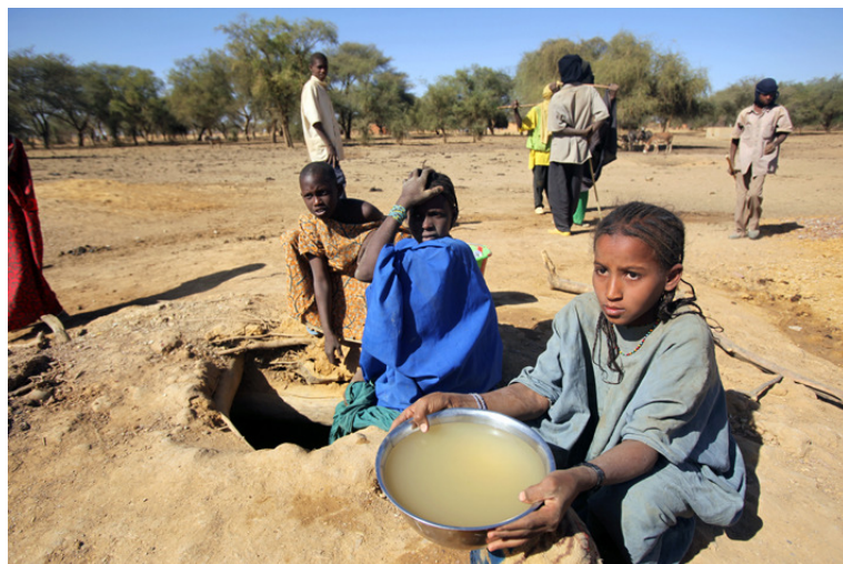
A young Malian refugee girl is about to drink the unclean water she collected from a local well in Ferrerio, northern Burkina Faso.