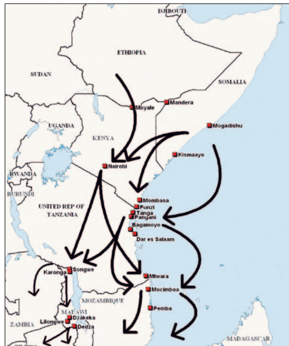
The eastern sea-board and the onwards journey

[Somali migrant, 35, Rustenburg, RSA, who was deported to Tanzania but made a new and