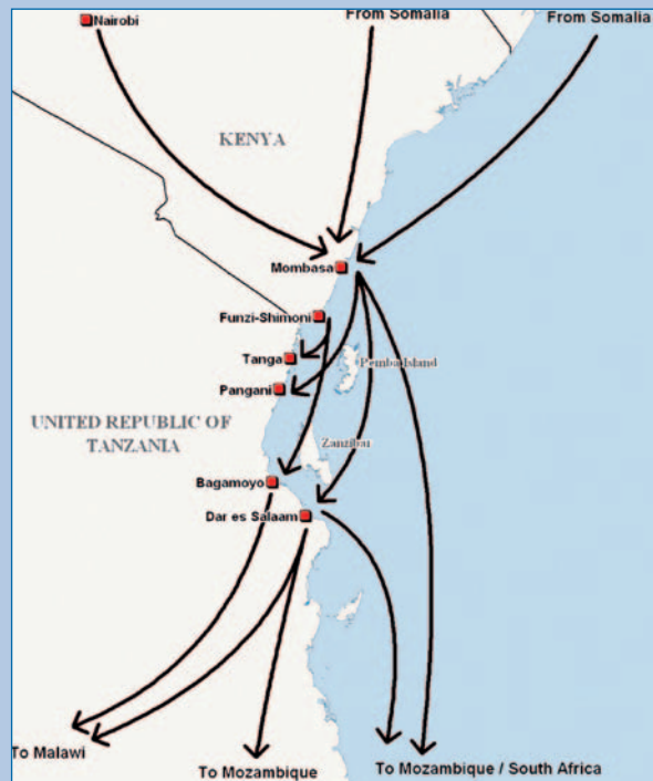
The route from Kenya to Tanzania through Funzi-Shimoni

Shimoni village, situated in a small mangrove peninsula two hours south of Mombasa by car, is the southernmost Kenyan settlement before Lungu Lungu, the border town with Tanzania. Wasani is a low island between Shimoni and Pemba, one of the Zanzibar islands. A small tarmac jetty has a half-dozen boats moored to it. The boats are open dhows or small motorboats. Swallows dive through the air as boys dive into the water. The customs and immigration offices line the shore a couple of hundred metres away. It's a sleepy village.