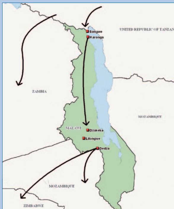
The route from Karonga transit Centre to Dzaleka refugee camp

The role of Malawi in the current smuggling business is an illuminating case study that illustrates a range of practices involving smugglers, some government refugee administrators and some law enforcement and immigration officials.