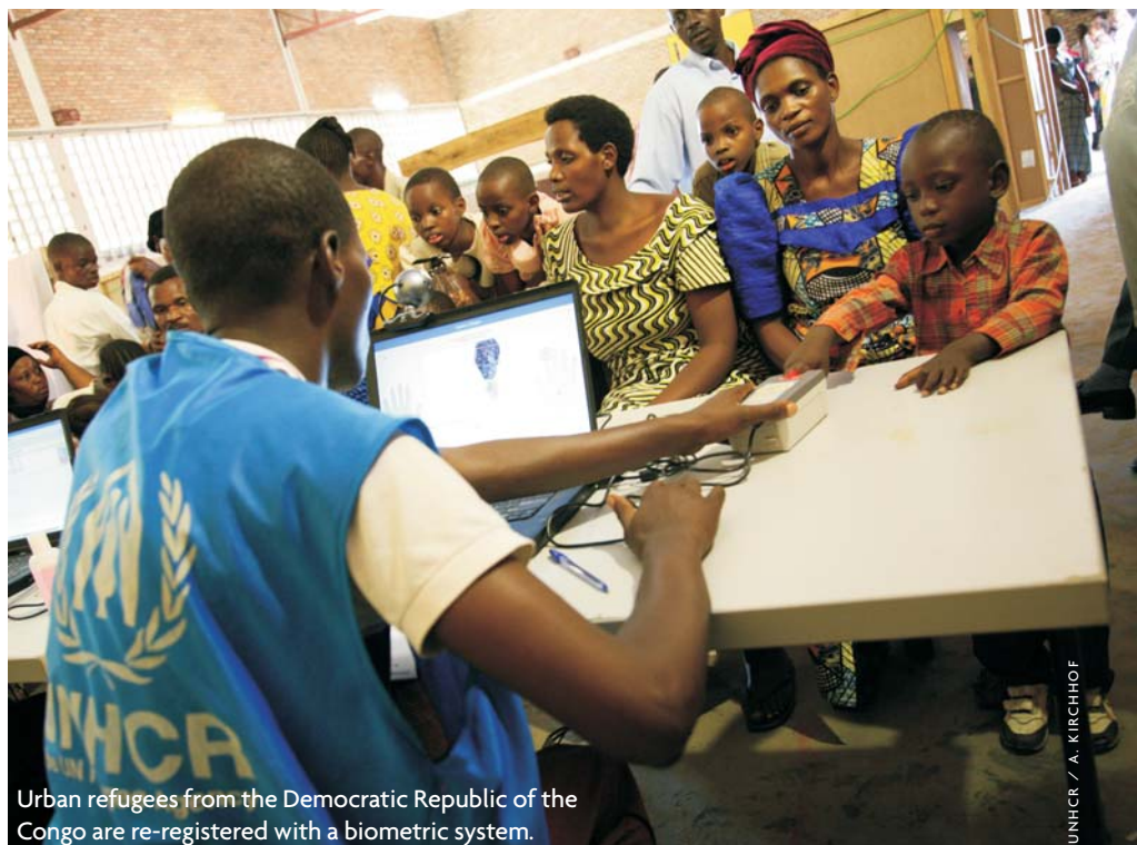
Urban refugees from the Democratic Republic of the Congo are re-registered with a biometric system.