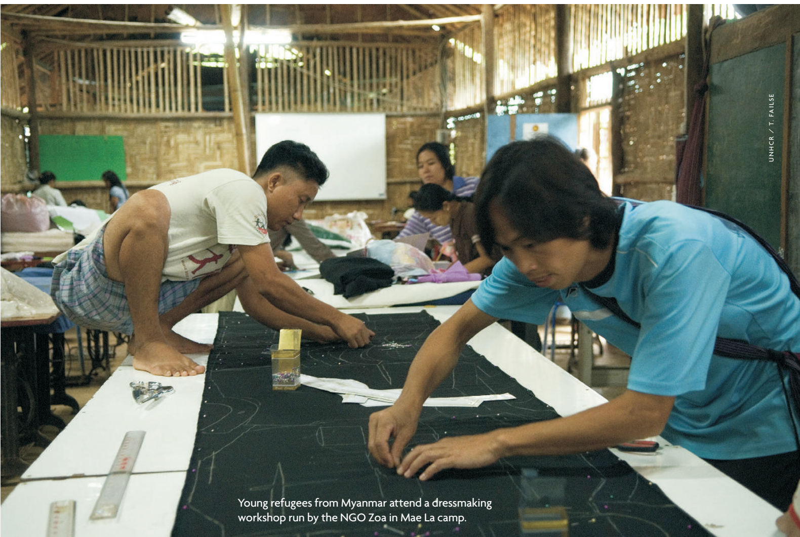
Young refugees from Myanmar attend a dressmaking workshop run by the NGO Zoia in Mae La camp.