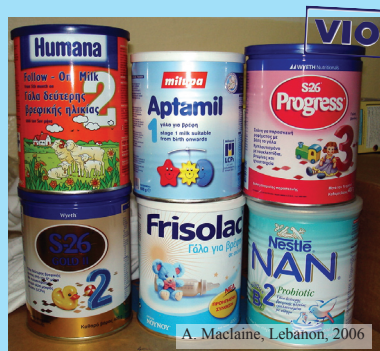
Labels of breastmilk substitutes shipped into Lebanon were in English and French, not Arabic.