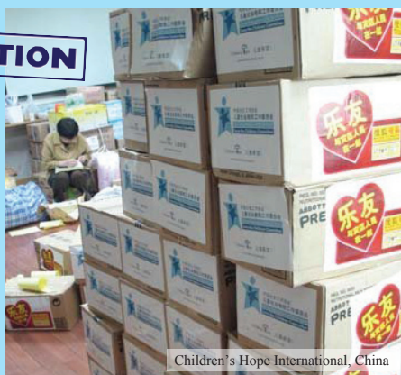
Piles of Abbott formula supplies after Sichuan earthquake.

“Donations of powdered milk in an emergency situation can literally increase the rate of death of young babies, while the people mean to do good.”