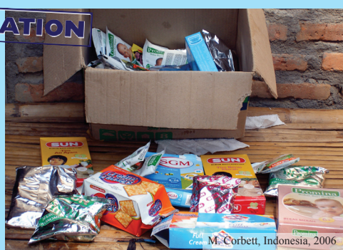
A box of donated ‘baby foods’ that a village woman had received in Java, Indonesia.