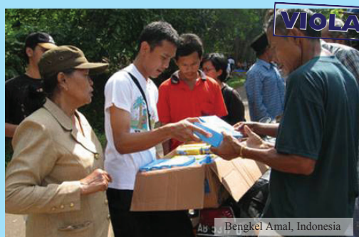
Milk and baby food for all. Companies often use emergency situations to offload products near expiry.