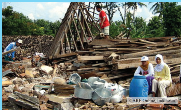
CARE Online, Indonesia

In all circumstances, and especially in emergency situations, emphasis should be on protecting, promoting and supporting breastfeeding and ensuring timely, safe and appropriate complementary feeding. However, in times of crisis, large donations of infant formula, feeding bottles and teats are often received from various sources. Although intentions are generally good, there is lack of awareness that such donations can do more harm than good as there are neither basic infrastructure nor adequate conditions to reduce the risks linked to the preparation of infant formula and other breastmilk substitutes. Therefore, these donations should be avoided. Instead, suitable substitutes forming part of the regular inventory of foods and medicines must be procured, distributed and fed only to the small number of infants who have to be fed on breastmilk substitutes after a proper needs assessment. This helps prevent situations where excessive availability of breastmilk substitutes results in mothers forsaking breastfeeding when it is in fact a lifeline. In emergencies more than ever, early initiation, exclusive breastfeeding until six months, and continued breastfeeding until two years or beyond, as recommended by WHO, need to be promoted, protected and supported for child health and survival.