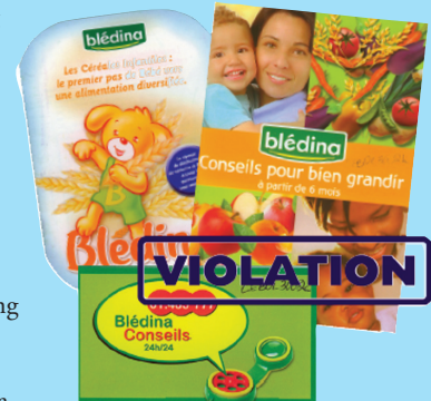
BTR 2007, Lebanon

Blédina produces infant formula, follow-up formula and many complementary foods. It was acquired by Danone in 1998. In 2007, Danone bought up all of Dutch NUMICO's companies. Since then, Danone and Nestlé run neck-to-neck to dominate the world market.