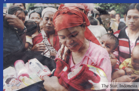
The Star, Indonesia

The use of feeding bottles and teats should be actively discouraged in emergency context due to the high risk of contamination and difficulty in cleaning. Instead, use of cups without spouts should be actively promoted.