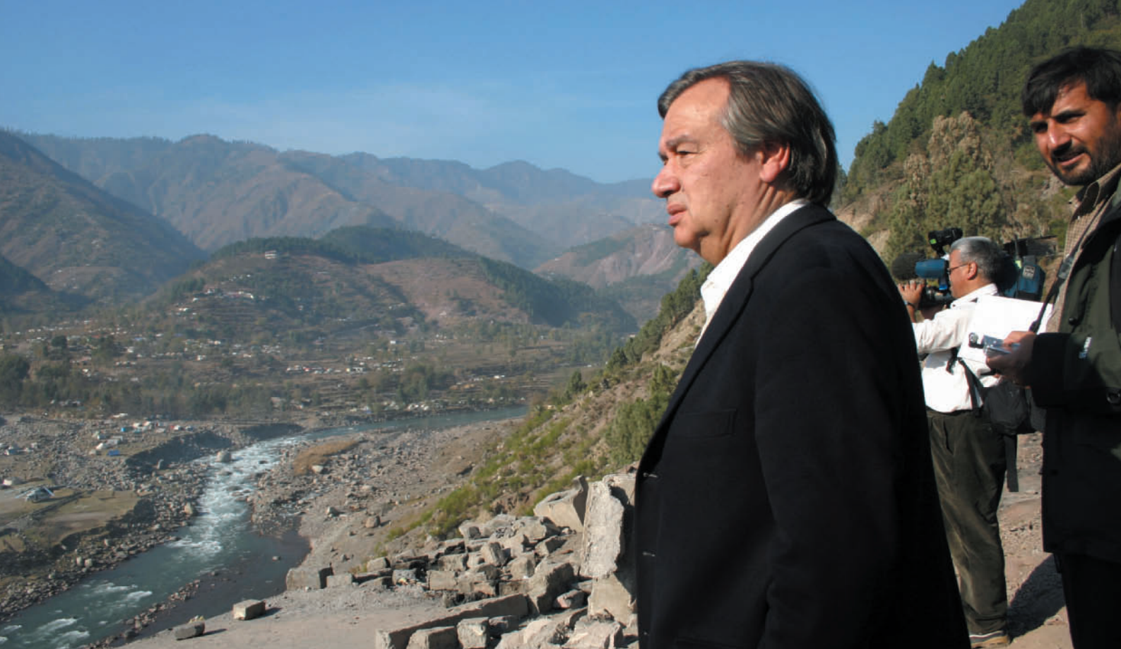
UN High Commissioner for Refugees António Guterres contemplates the destruction caused by the South Asia earthquake in Balakot town in Pakistan.

South Sudan with almost no health services or education, and all of 14 kilometres of paved road. By the end of the year, it was clear that tens of thousands of internally displaced people had come back to the South from Khartoum but that many refugees, anxious about the lack of infrastructure, were delaying their return.