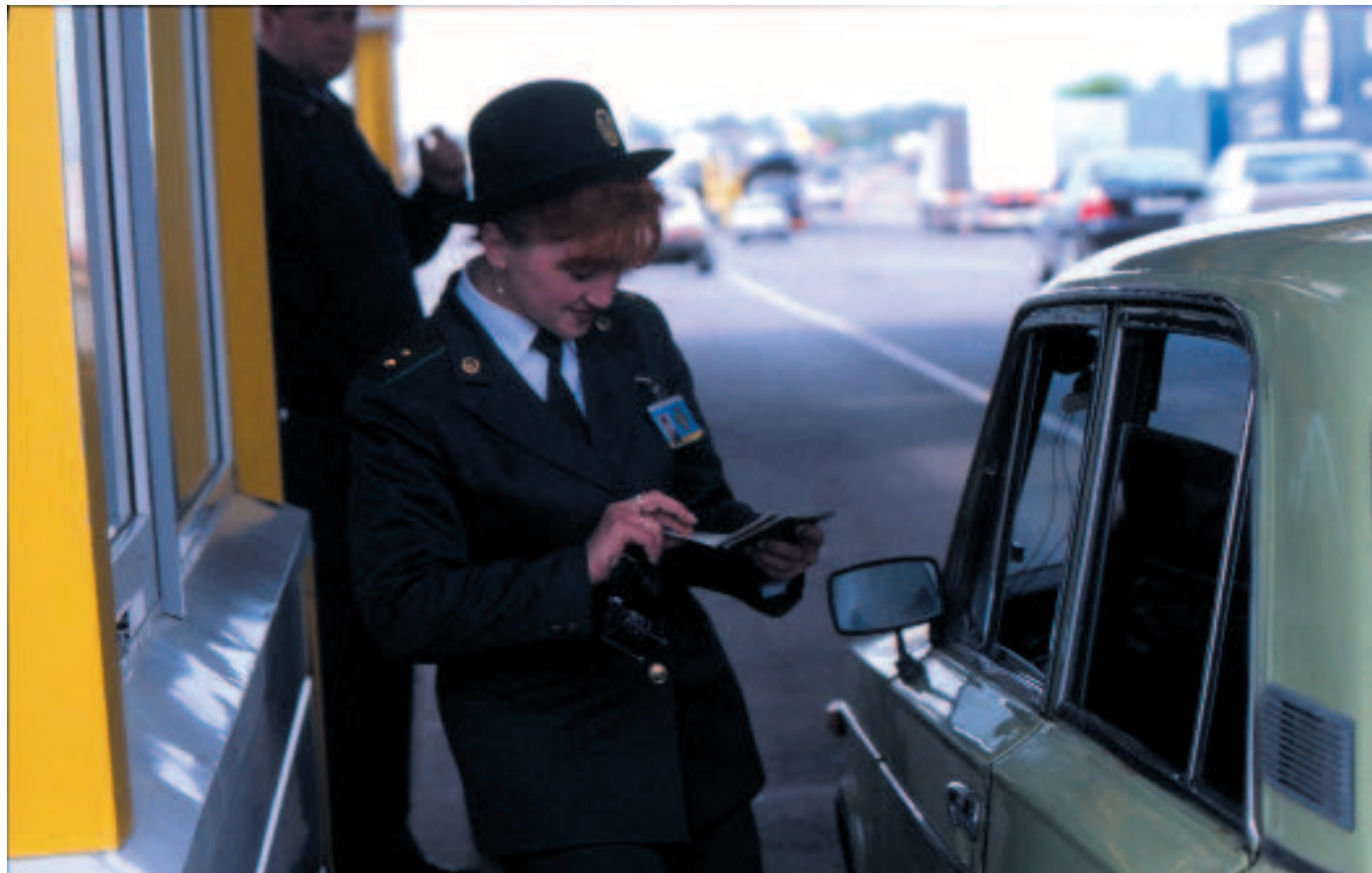
Ukrainian-Hungarian border checkpoint: As a result of Hungary joining the EU in May 2004, security at its non EU borders has been increased and new border procedures put into place.