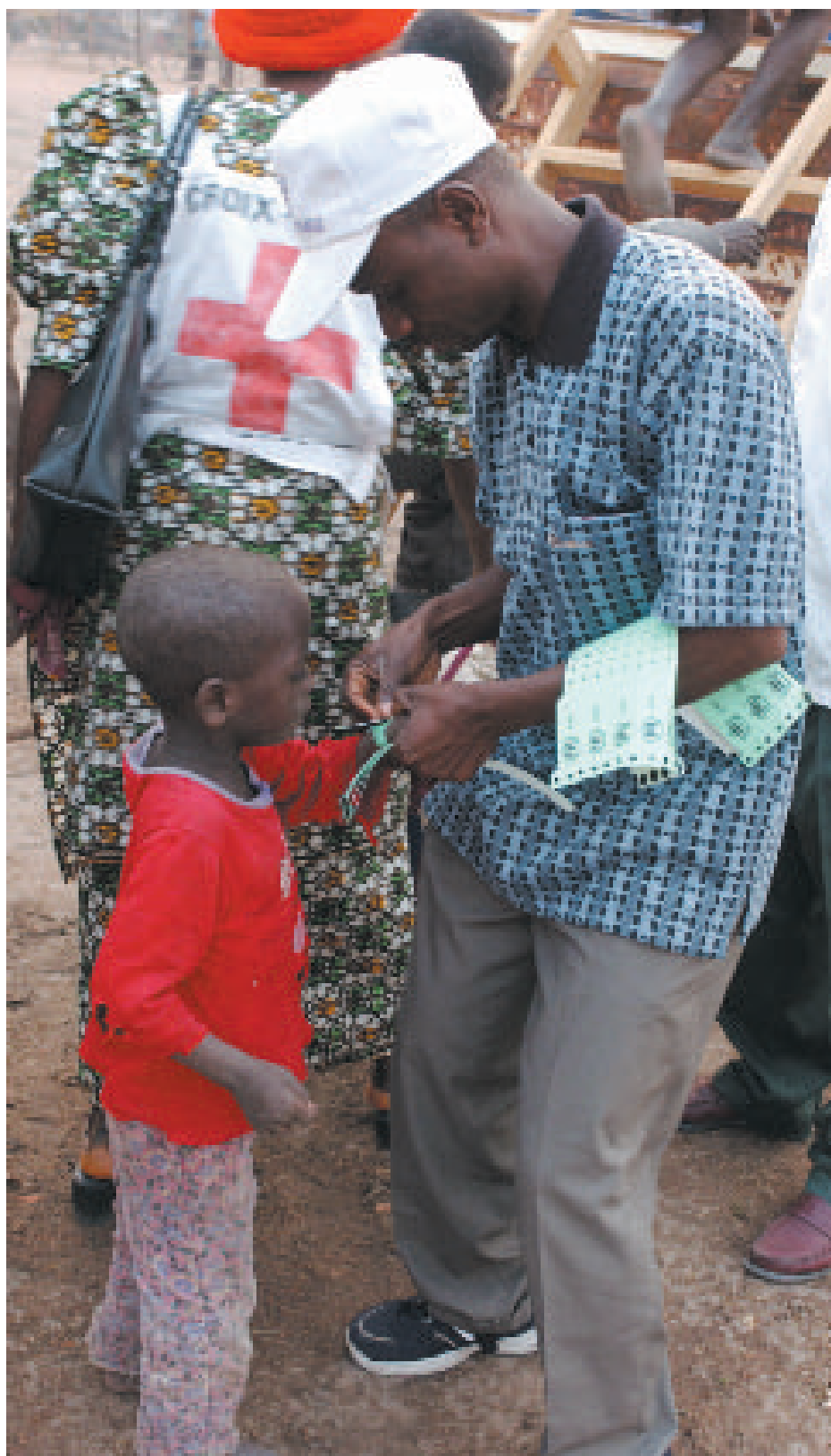
The start of the journey home - repatriation of Angolans.

The Office will intensify ongoing dialogue with host governments to persuade them to enact refugee legislation conducive to better protection of refugees and asylum-seekers. UNHCR will also focus on creating a legal environment conducive to sustainable local integration of refugees who may choose to remain indefinitely in their countries of asylum. The Office will work closely with governments to ensure that asylum applications are dealt with efficiently and effectively.