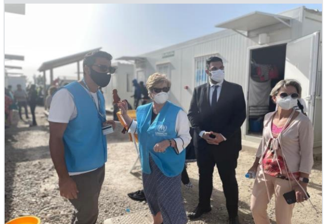
Access to territory and asylum and improving reception conditions for asylum-seekers dominated the four-day visit of the UNHCR's Assistant High Commissioner for Protection, Gillian Triggs to Cyprus in April 2021.