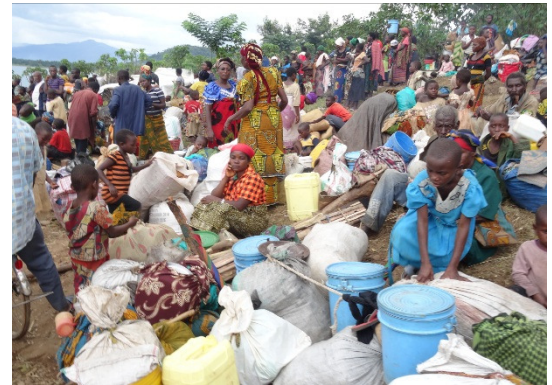
Burundian asylum seekers waiting for a ferry to take them across Lake Tanganyika into Tanzania.