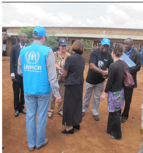
US Ambassador in Bujumbura visits Musasa refugee camp.