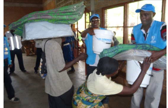
UNHCR staffs distribute relief assistance to the victims of landslide.

Offices: 01 country Office in Bujumbura; 01 Sub Office in Muyinga; 01 Field Office in Ruyigi.