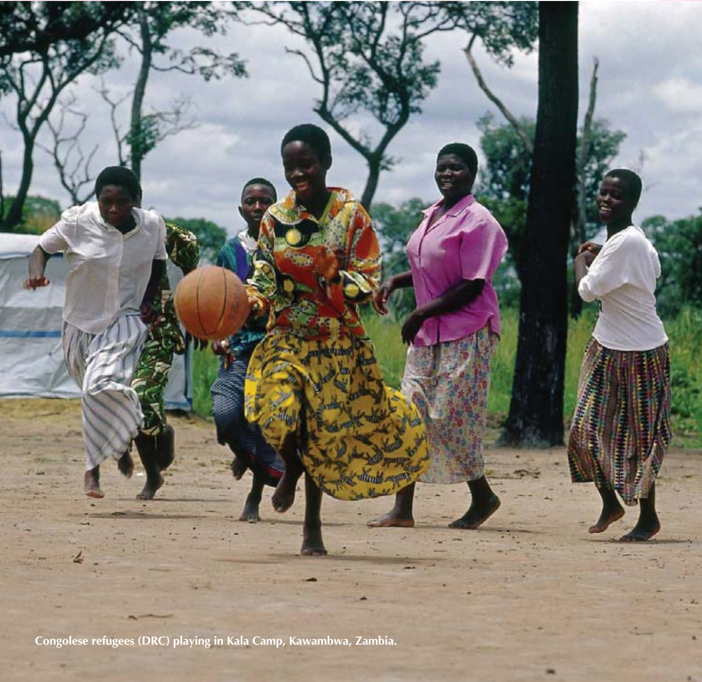
Congolese refugees (DRC) playing in Kala Camp, Kawambwa, Zambia.