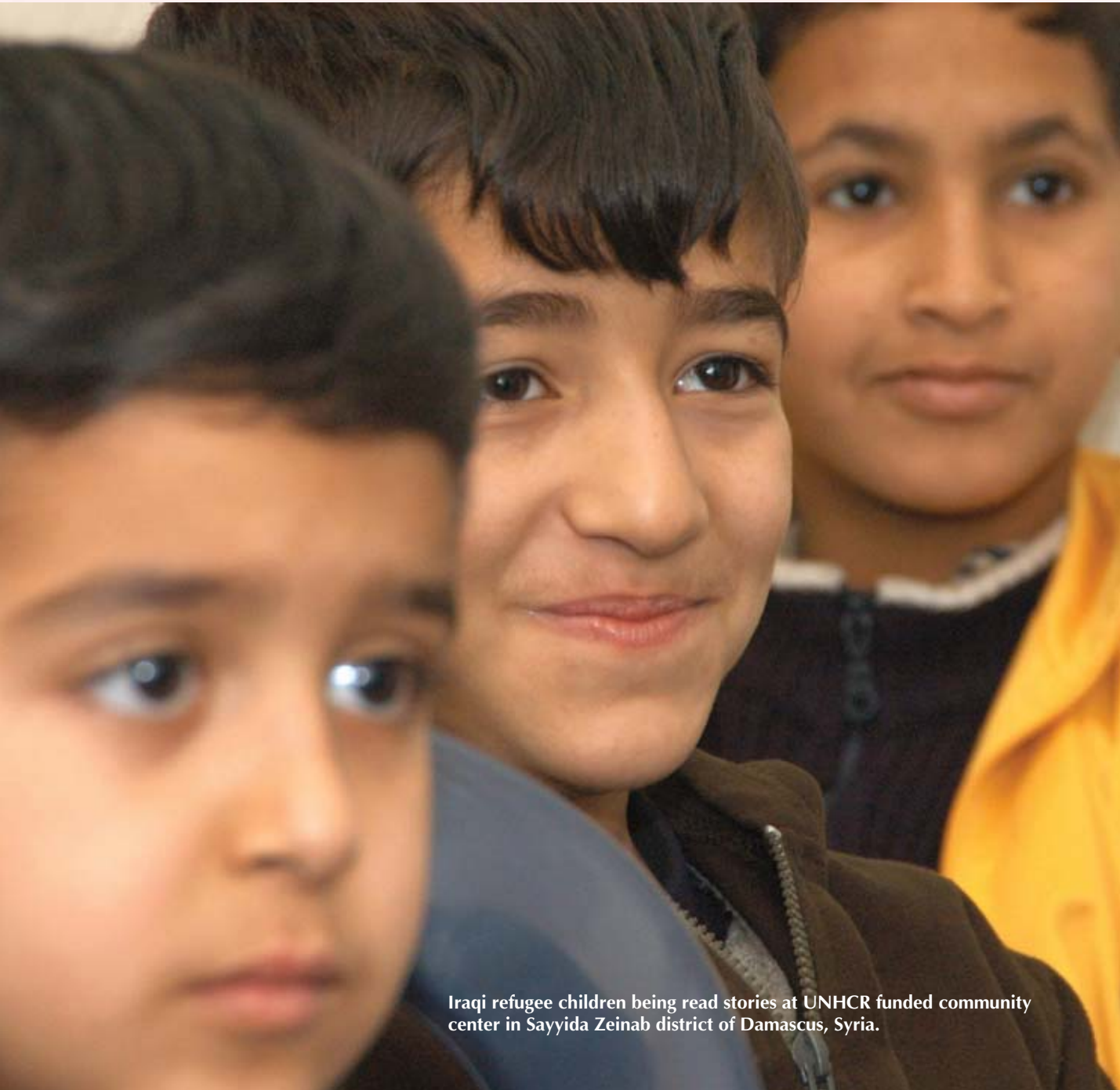
Iraqi refugee children being read stories at UNHCR funded community center in Sayyida Zeinab district of Damascus, Syria.