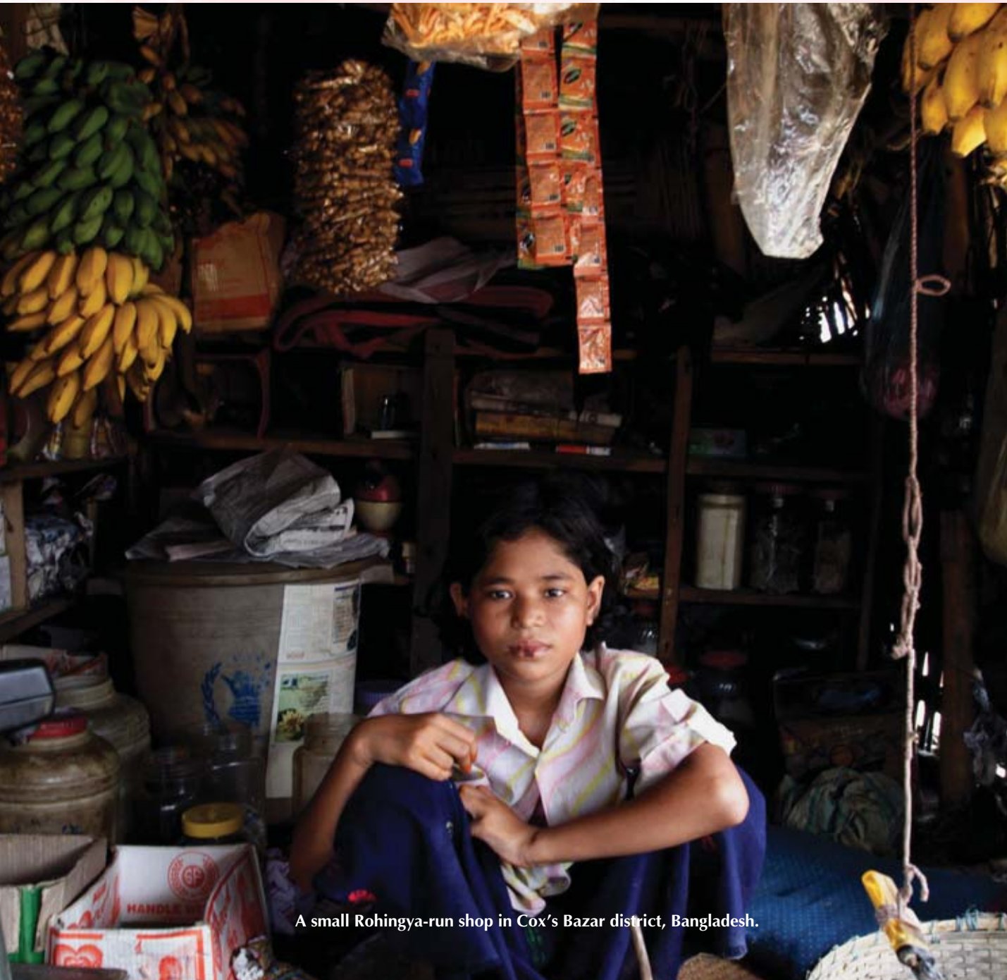
A small Rohingya-run shop in Cox's Bazar district, Bangladesh.