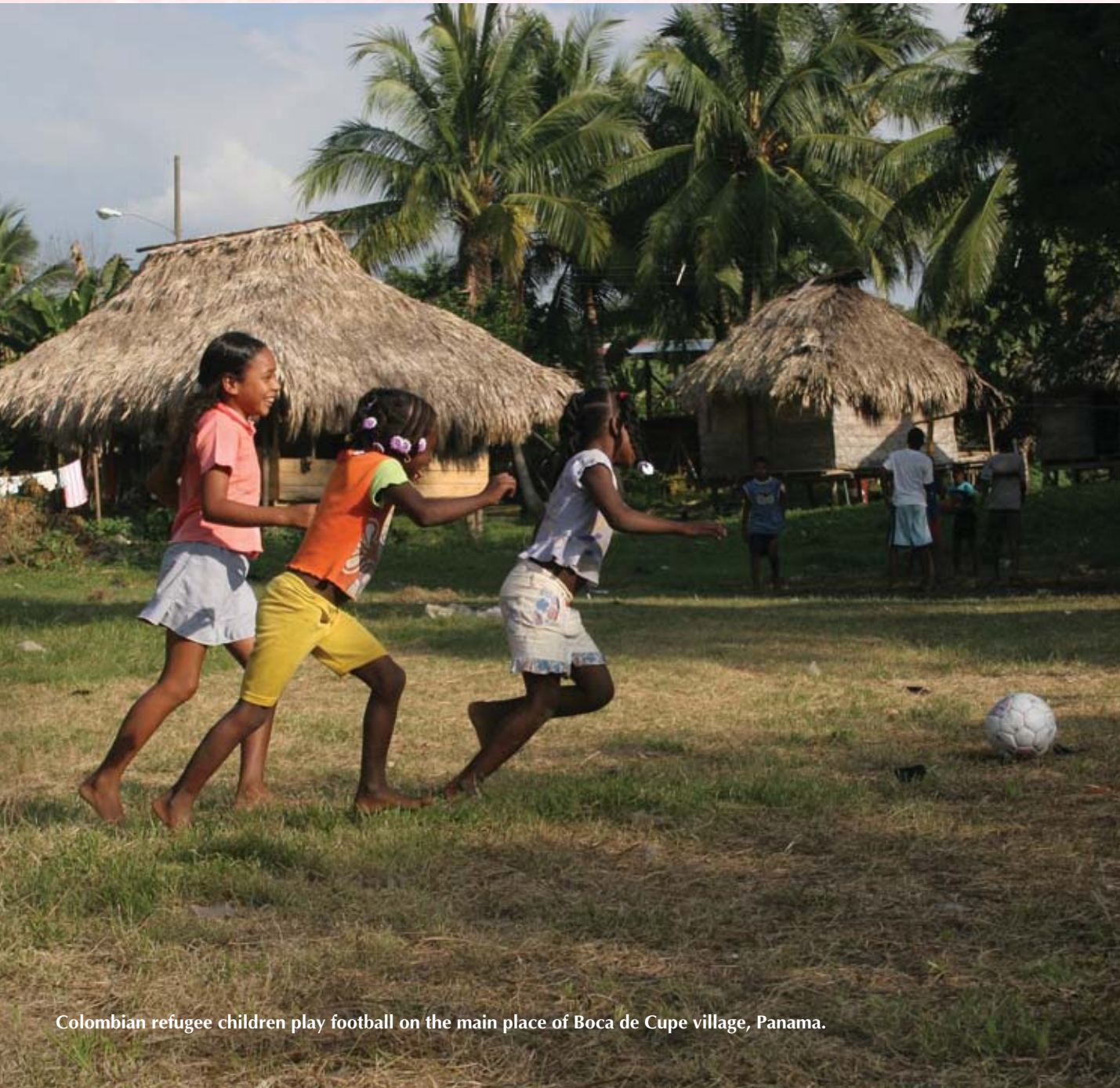
Colombian refugee children play football on the main place of Boca de Cupe village, Panama.