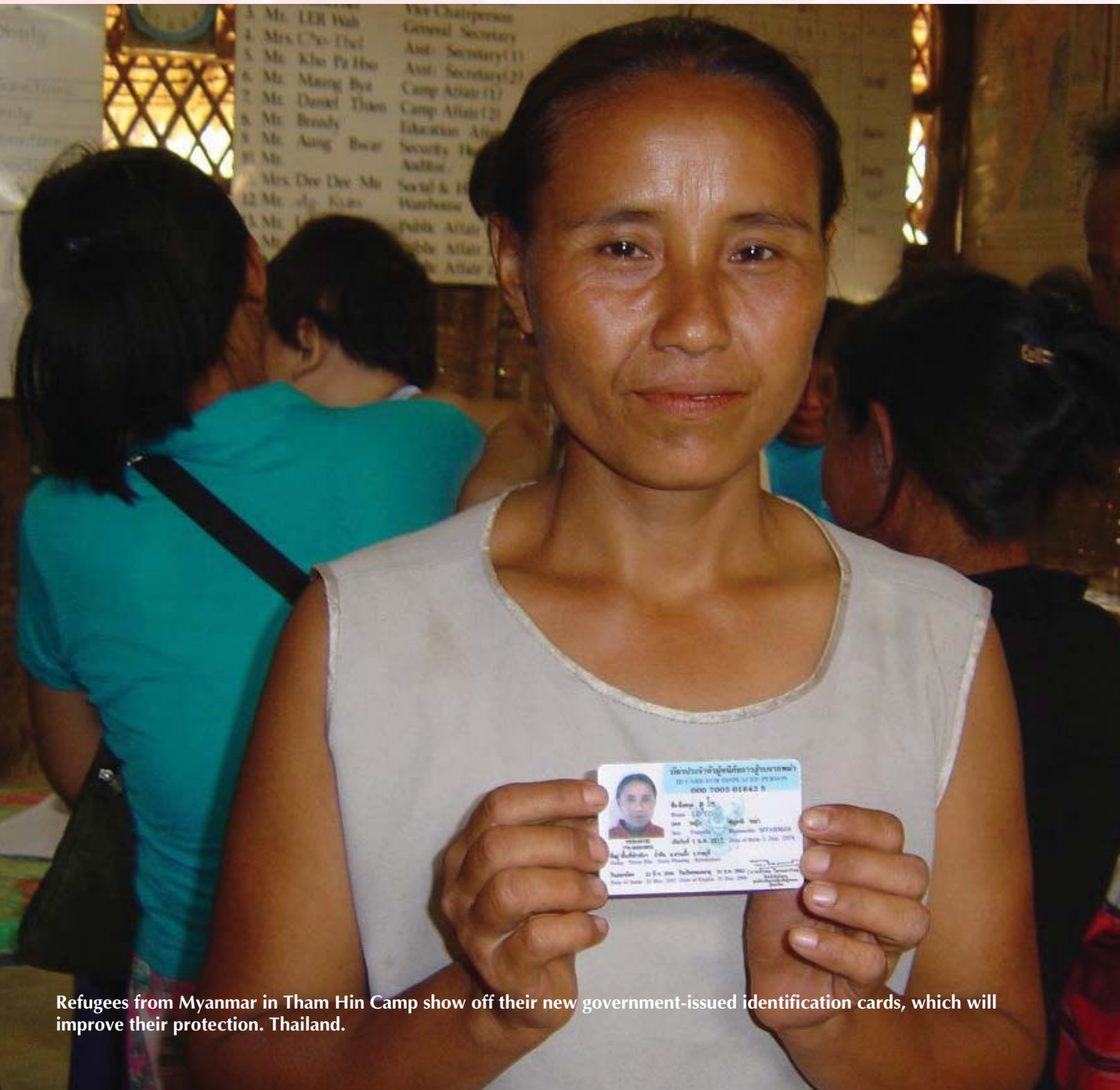
Refugees from Myanmar in Tham Hin Camp show off their new government-issued identification cards, which will improve their protection. Thailand.