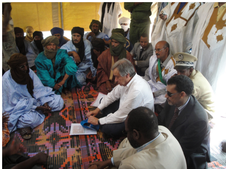
The High Commissioner Antonio Guterres meeting with representatives of the Malian refugees in Mberra Camp in Mauritania on 26 March 2012.