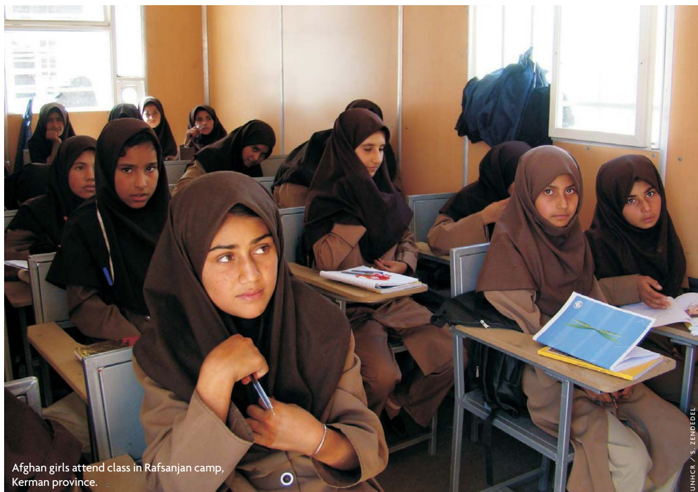
Afghan girls attend class in Rafsanjan camp, Kerman province.