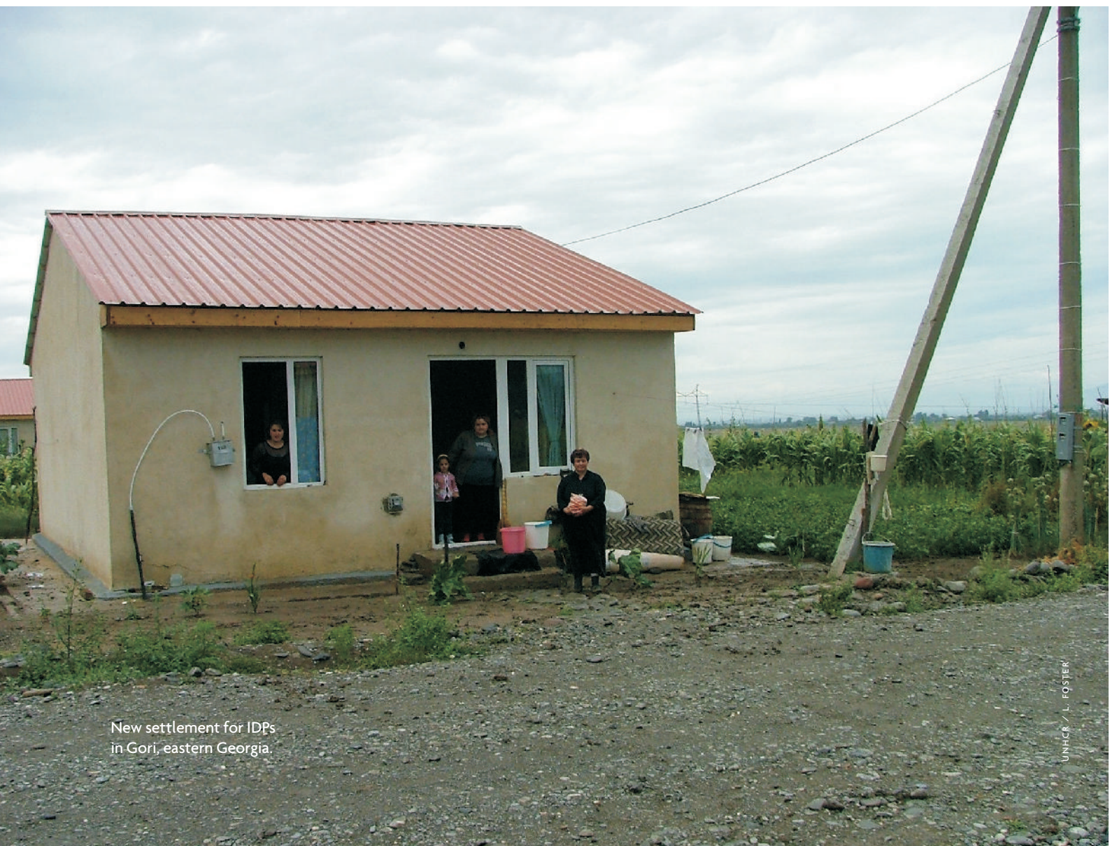
New settlement for IDPs in Gori, eastern Georgia.

UNHCR provided training on international refugee law to more than 600 law enforcement personnel. It also assisted six refugees to find resettlement opportunities and 15 to repatriate.