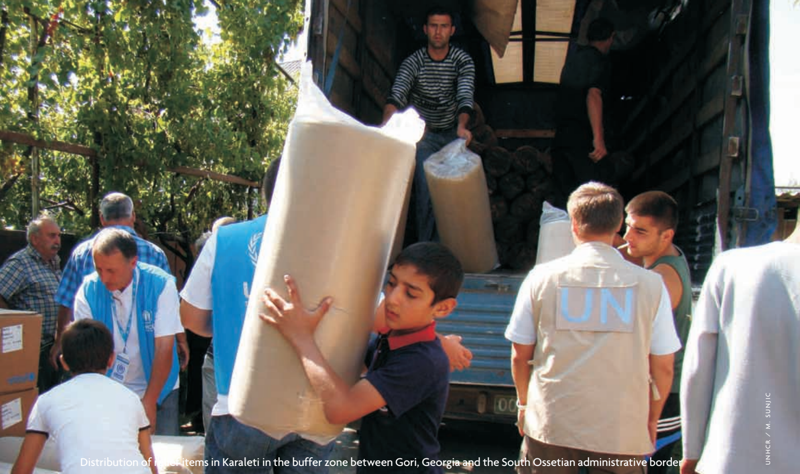
Distribution of winter items in Karaleti in the buffer zone between Gori, Georgia and the South Ossetian administrative border