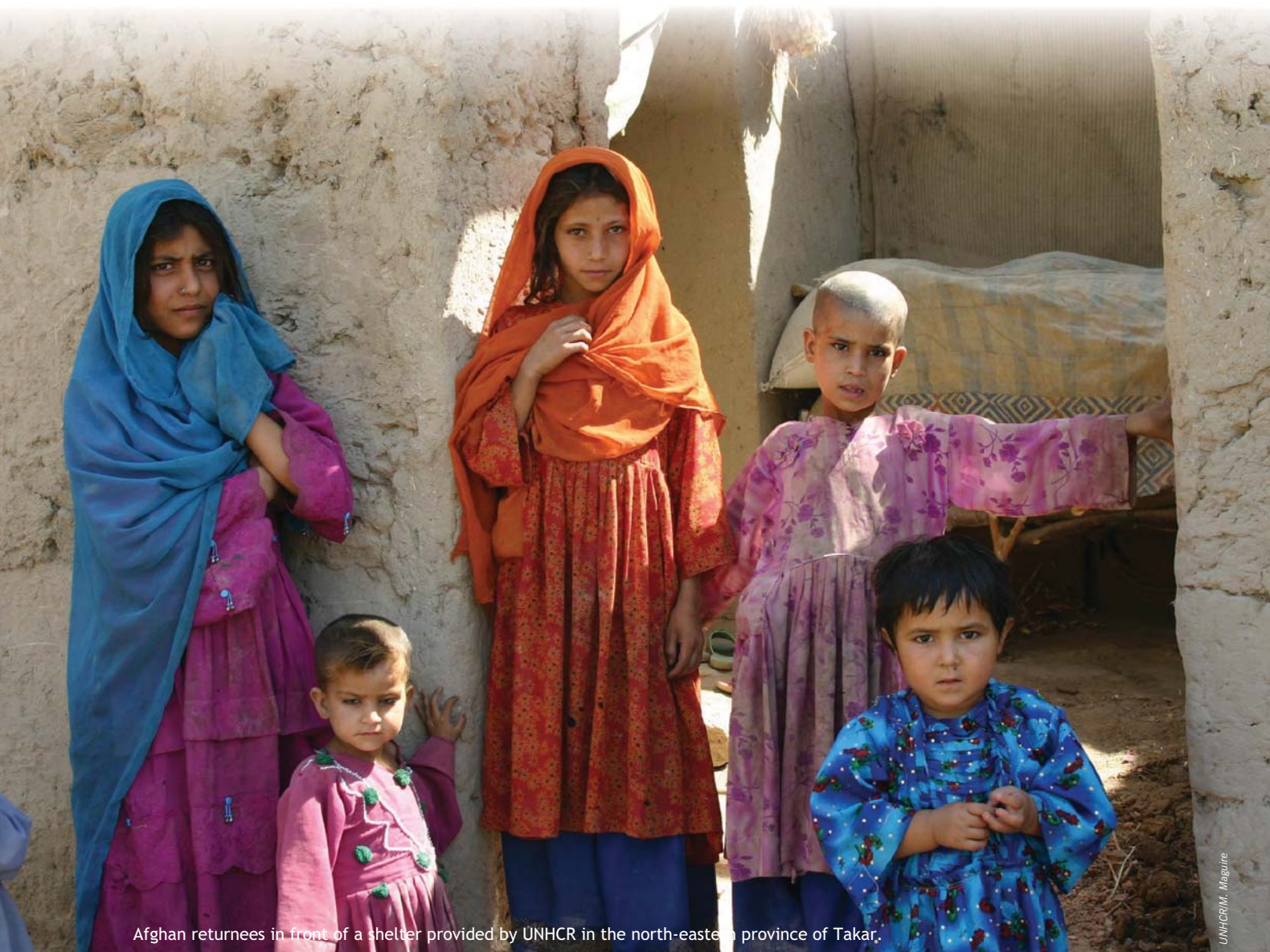
Afghan returnees in front of a shelter provided by UNHCR in the north-eastern province of Takar.

Partnerships will be strengthened with human rights and rule of law actors through bilateral exchanges and cooperation, as well as through the humanitarian