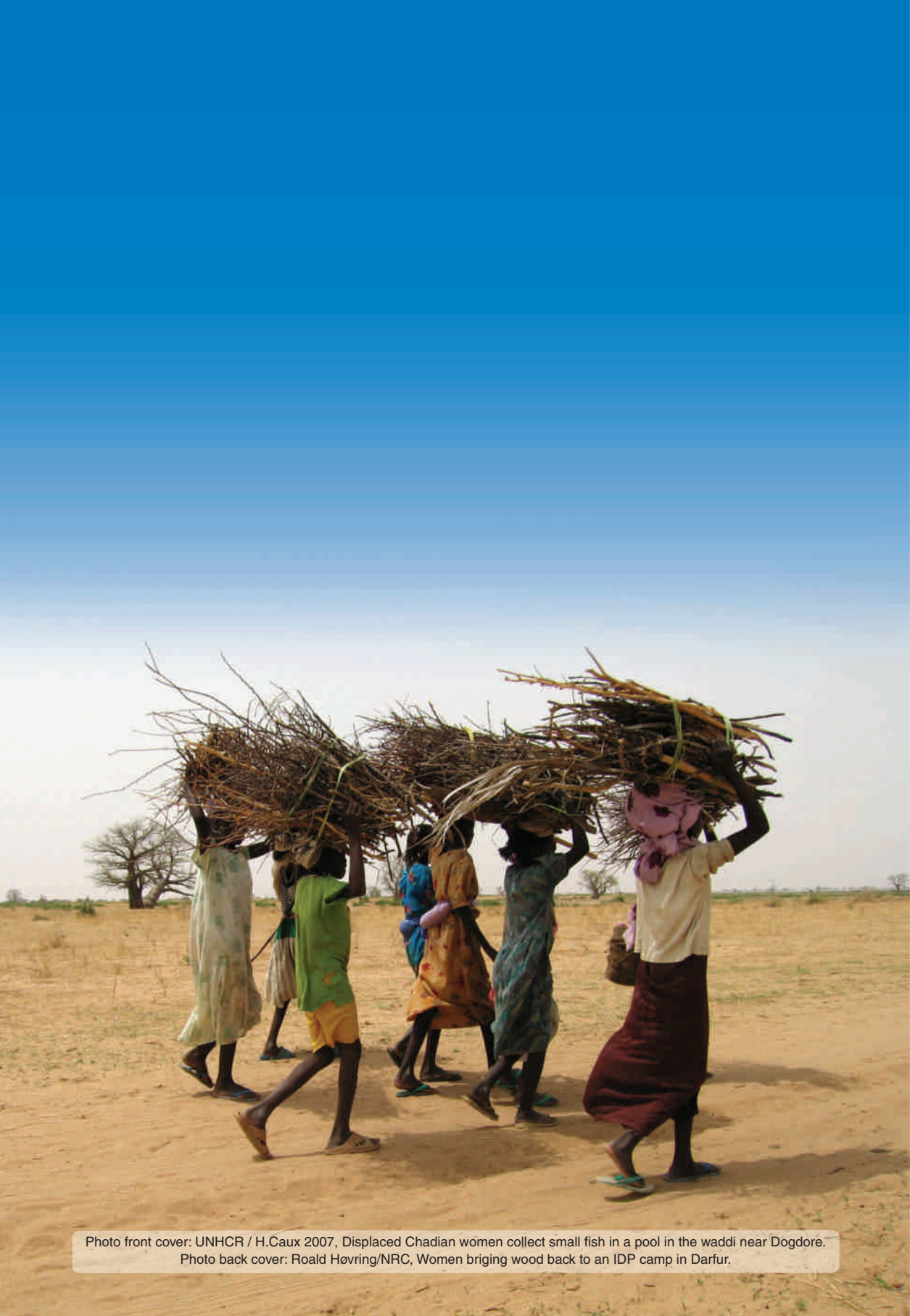
Displaced Chadian women collect small fish in a pool in the waddi near Dogdore. Women bringing wood back to an IDP camp in Darfur.