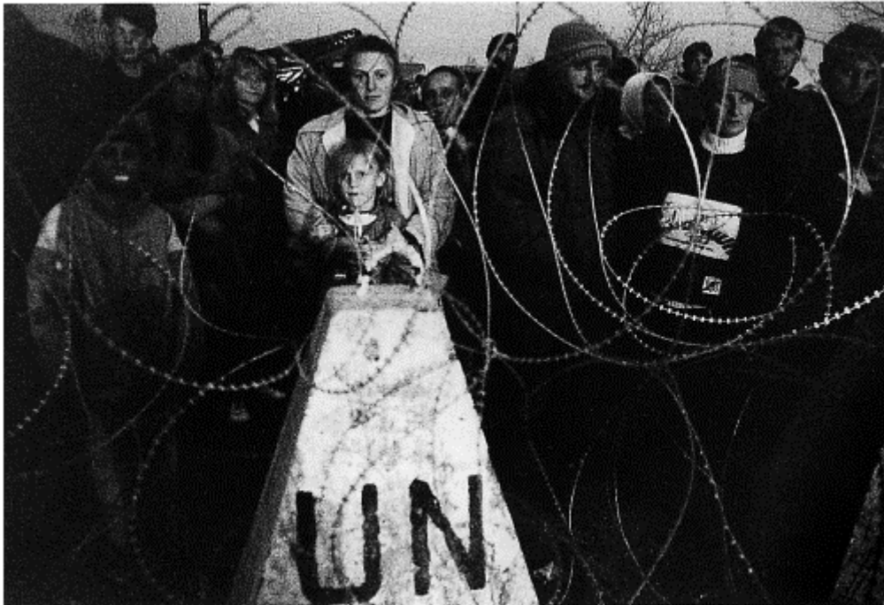
Displaced Bosnians at Turanj on the Croatian border, November 1994

Large-scale movements of refugees and other forced migrants have become a defining characteristic of the contemporary world. At few times in recent history have such large numbers of people in so many parts of the globe been obliged to leave their own countries and communities to seek safety elsewhere. Never before has the issue of mass population displacement gained such a prominent position on the agenda of the United Nations and its member states. And in no other age has the plight of uprooted people been so swiftly and graphically communicated to such an extensive public audience.