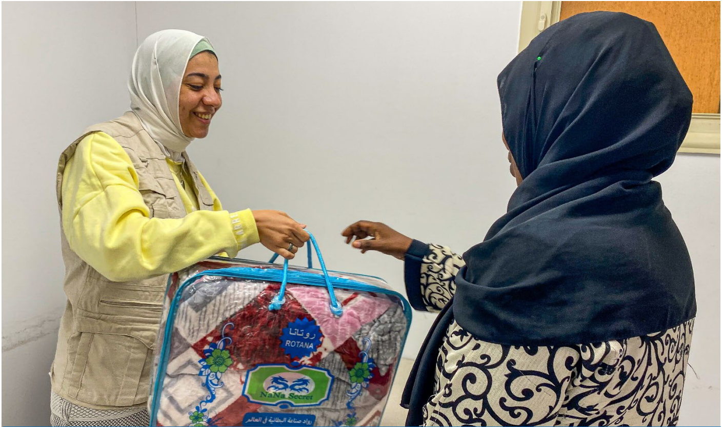
On 4 December, UNHCR and its partner CARE distributed blankets to eleven refugee families in Cairo. These items will be essential for the families' well-being throughout the winter.