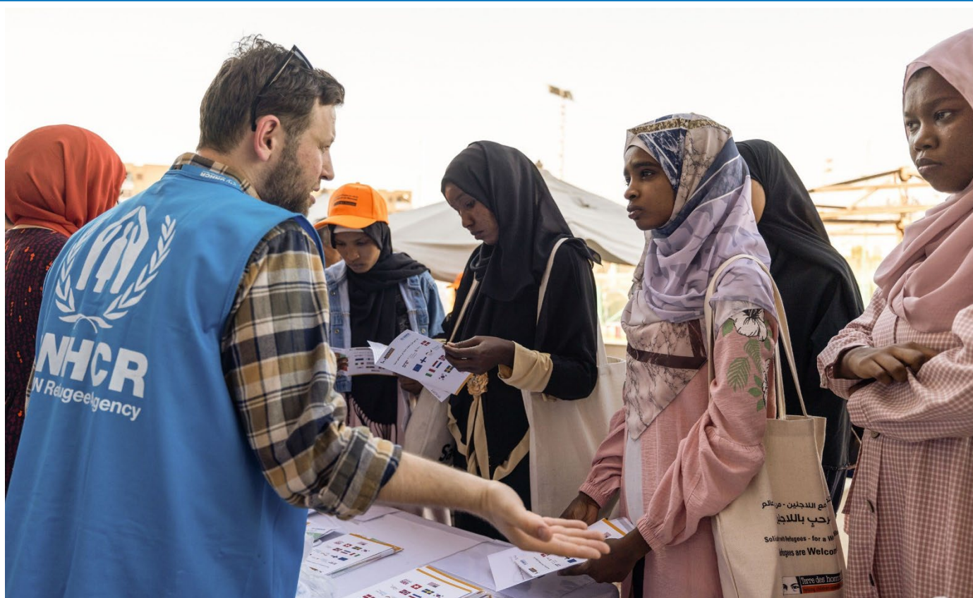
UNHCR staff provide information on protection and assistance to Sudanese women in Greater Cairo.