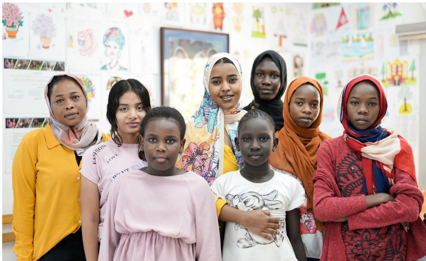
A group of refugee students attended a focus group discussion during the Education Cannot Wait high-level mission to Cairo on 22 August.