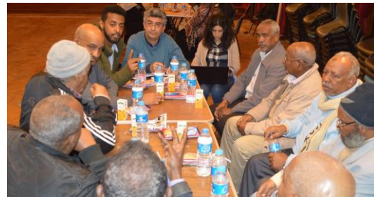
Women, men, girls and boys of different nationalities during focus group discussions of the Participatory Assessment.