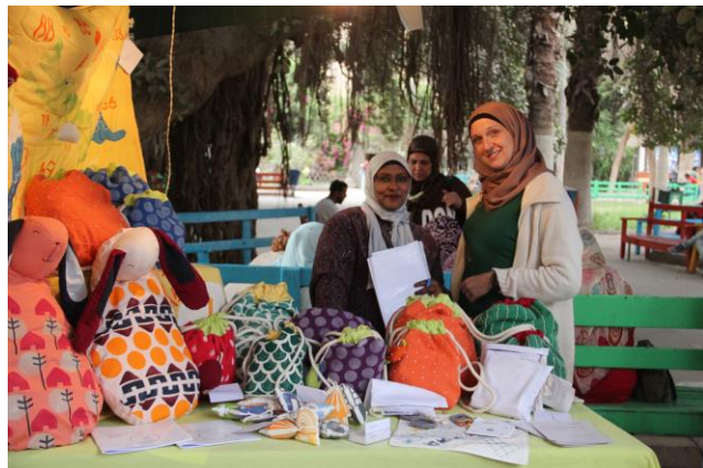
Participants of the NilFurat project selling their handicrafts in Cairo

bringing together economically vulnerable Egyptian women with refugees from Syria, Eritrea, and Ethiopia to make high quality handicrafts.