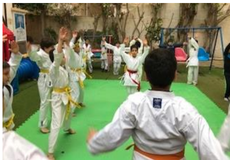
Children during self-defence workshop at Agamy Community Centre in January

Egypt. On a monthly basis, the centre serves several hundred refugees and asylum-seekers through its activities and information desks. Initiatives in January and February included self-defence classes for children, workshops on income-generating activities, and recreational classes . The centre also started to increase its outreach to older people and people living with disabilities , and now offers a variety of activities that are customized to their needs.