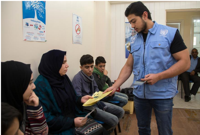
UNHCR staffer handing a Syrian family their documents at the reception area of the field office in Alexandria.

In close cooperation with partner agencies, the UNHCR field office works to provide protection and assistance to refugees and asylum-seekers. While the registration and counselling activities take place at the UNHCR premises in Alexandria, the team also conducts mobile missions to reach out to refugees and asylum-seekers in remote areas in order to register them and address their needs and concerns. Together with the country office in Cairo, the field office supports refugees' access to basic services such as education and health care.