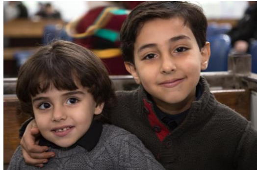
Students in school in Cairo.