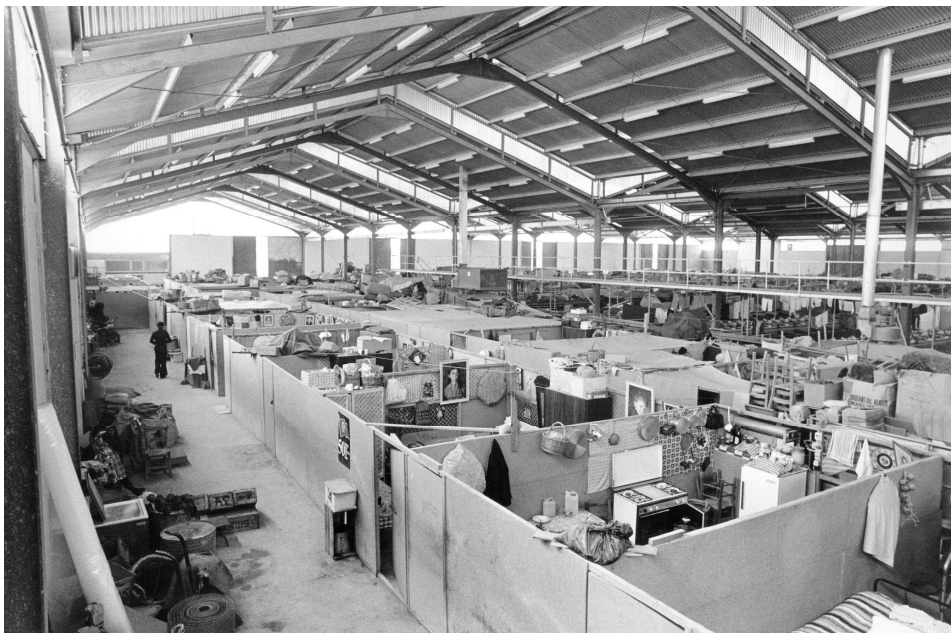
In 1974, some 400,000 people were internally displaced in Cyprus. UNHCR arrived on the island and coordinated humanitarian aid, including food, health and shelter provision.

UNHCR has been present in Cyprus since 1974 when it arrived on the island to provide humanitarian aid for the displaced populations in both communities. By 1998, the need for relief assistance for internally displaced Cypriots had declined, and UNHCR handed over the work to other UN development agencies. With the increase of refugee arrivals in 1998, and in the absence of national asylum legislation and infrastructure, UNHCR had to assume the responsibilities for registering asylum-seekers arriving on the island and processing their applications. In 2000, the Republic of Cyprus adopted its first national refugee legislation and asylum procedures, and in 2002 it took over from UNHCR the responsibility for asylum adjudication.