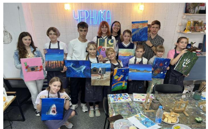
The participants of the art workshop

In late 2023, UNHCR distributed drawing sets to 20 children, including refugees from Ukraine, in temporary accommodation centres for asylum-seekers (TAC) in Vitebsk and Mogilev regions.