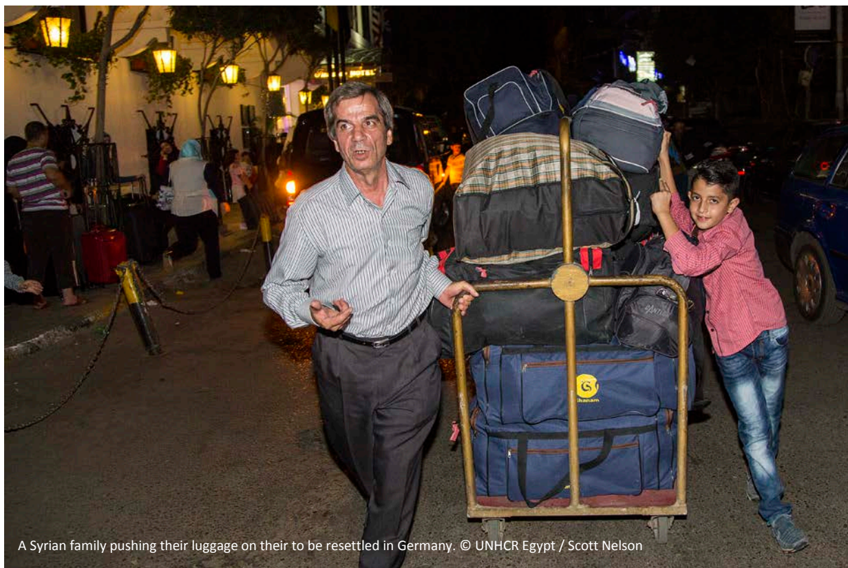
A Syrian family pushing their luggage on their way to be resettled in Germany.