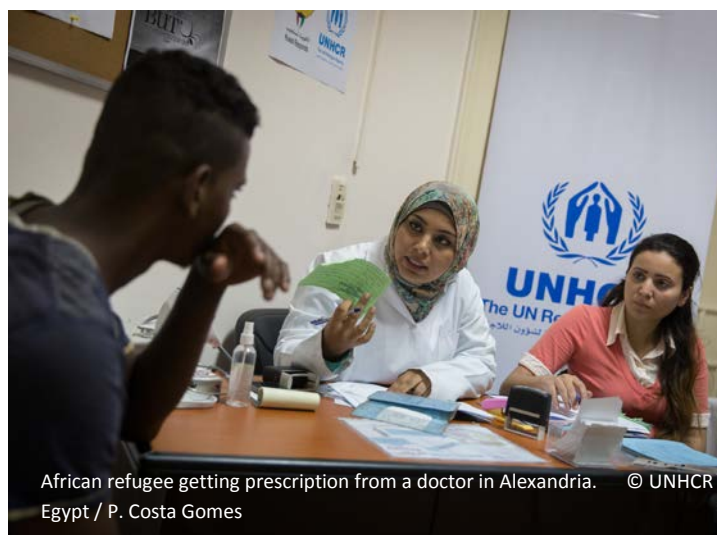
African refugee getting prescription from a doctor in Alexandria.