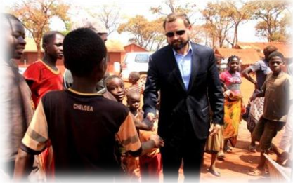
US Special Envoy to the Great Lakes Region, Mr. Perriello greets refugees in Nyarugusu Camp